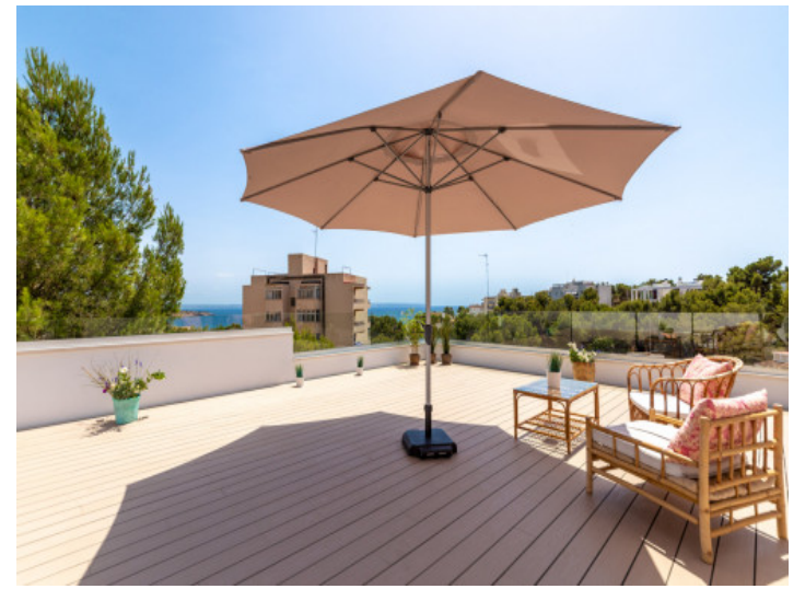
Fantastic views to the sea