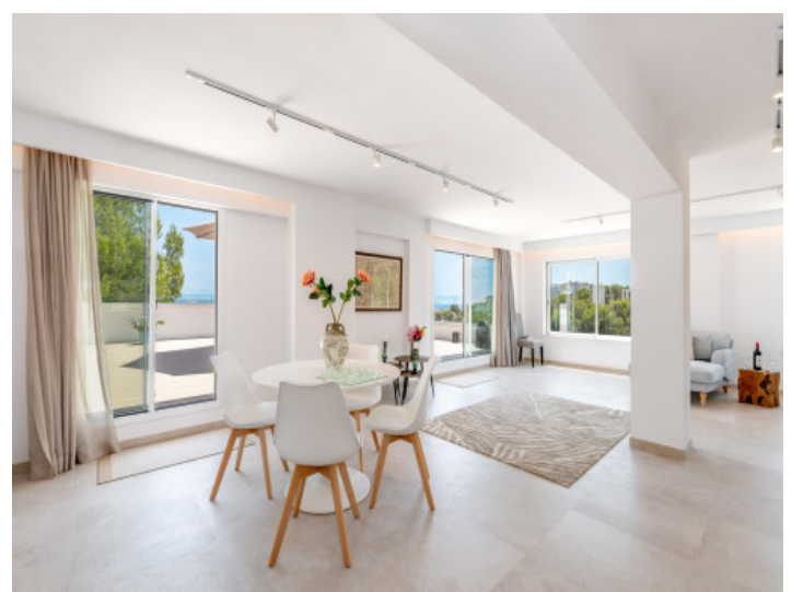
Terrace access from the dining area