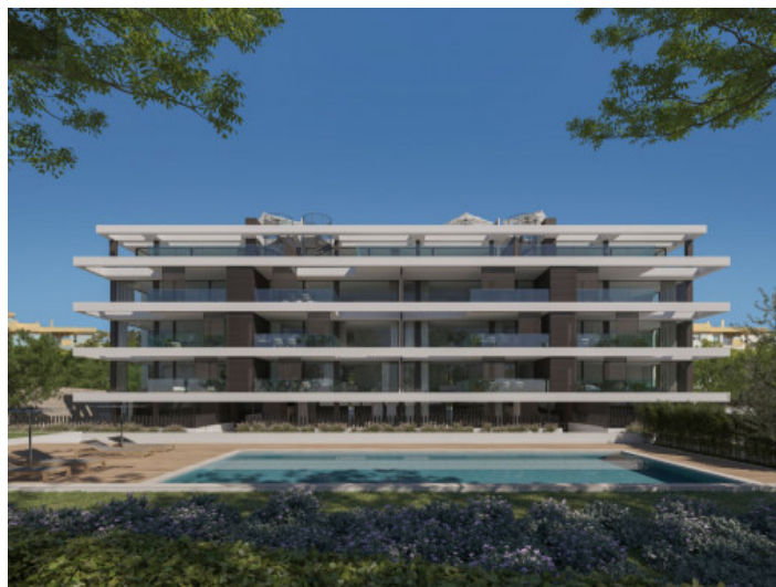
Views to the building