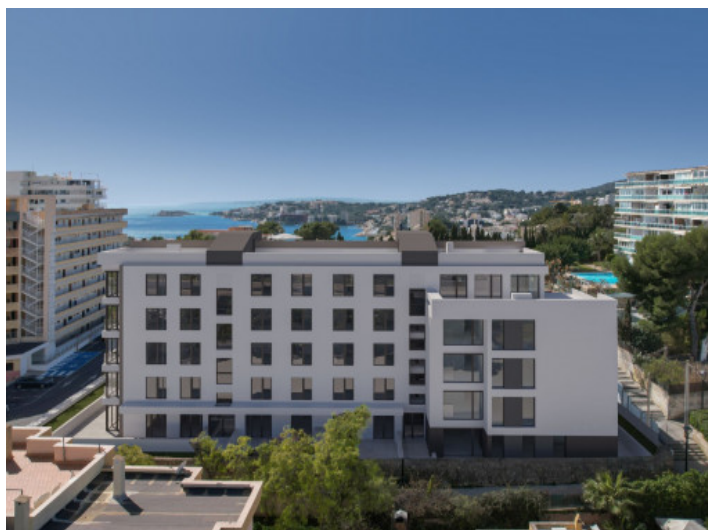
Bird's-eye-views to the building