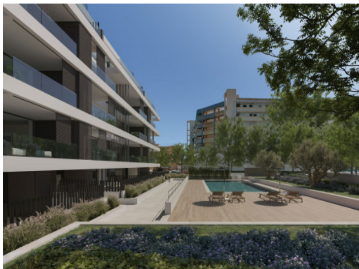
Community area with pool