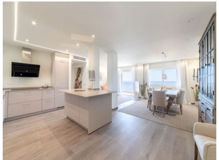
Modern kitchen with island