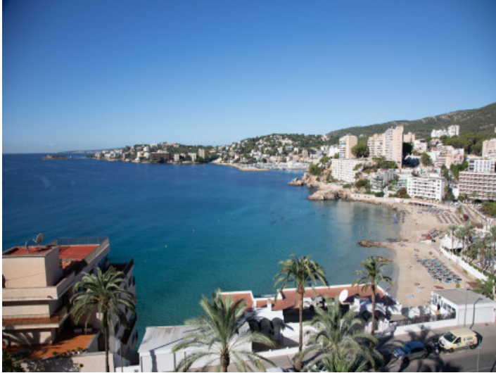
Breathtaking sea views