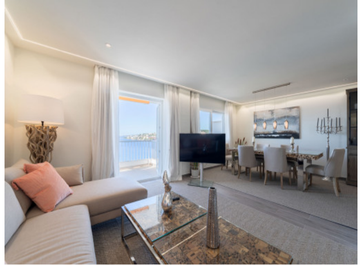
Luxurious living and dining area