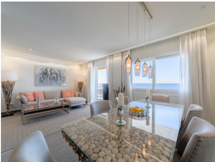
Living and dining area with sea views