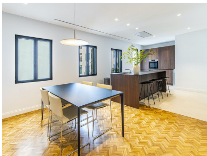
Modern kitchen and dining area