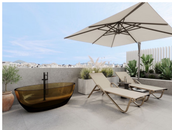
Private roof terrace