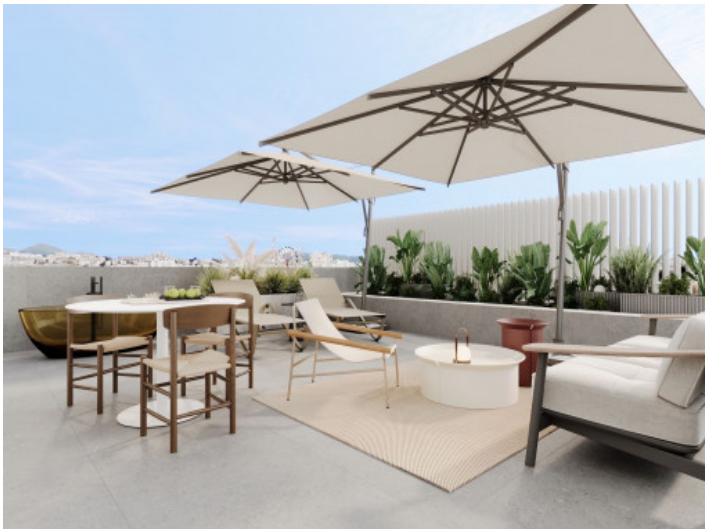
Roof terrace with luxurious lounge area