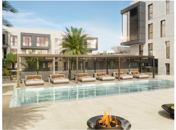
Inviting pool area