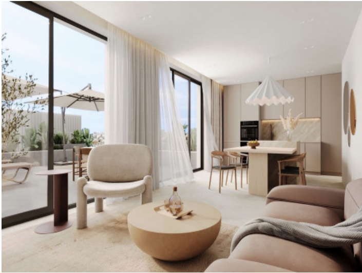
Living and dining area with access to a terrace