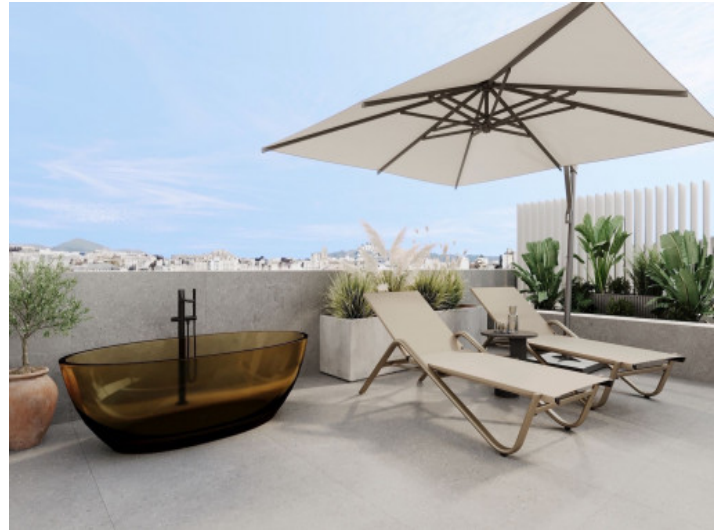
Private roof terrace