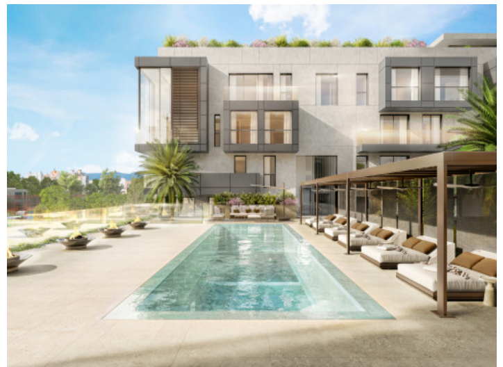
Alternative view of the pool

All information is correct to the best of our knowledge. Errors and prior sale excepted. This prospectus is purely for information purposes. Only the notarized deed of sale is legally binding.