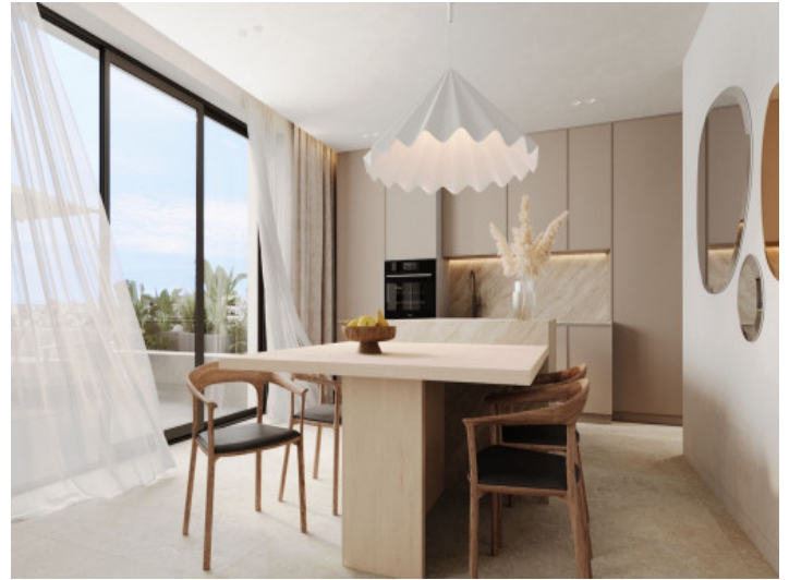
Kitchen and dining area