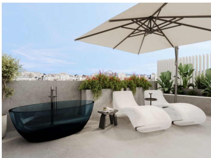
Lounge area on the roof terrace