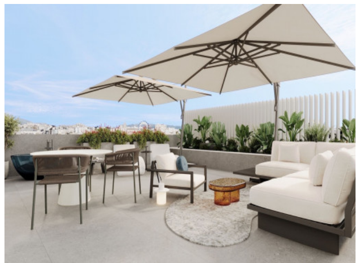
Lounge area on roof terrace

All information is correct to the best of our knowledge. Errors and prior sale excepted. This prospectus is purely for information purposes. Only the notarized deed of sale is legally binding.