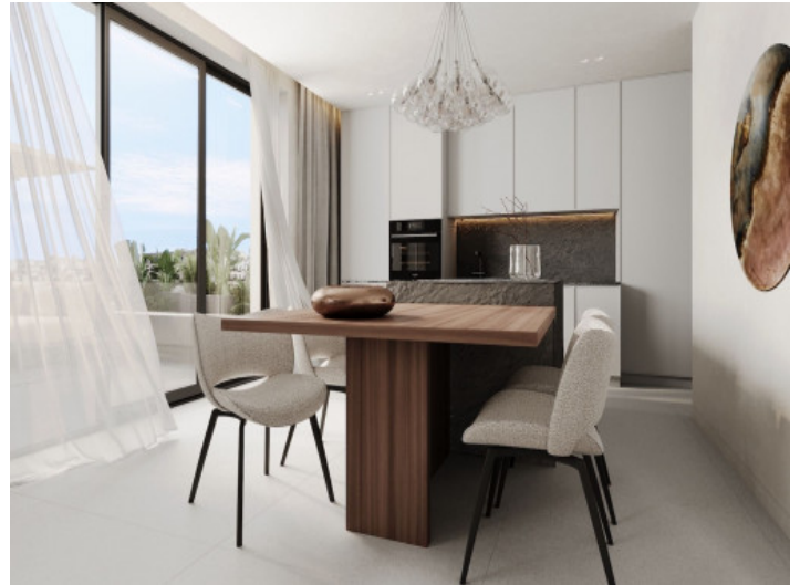
Modern kitchen with dining area