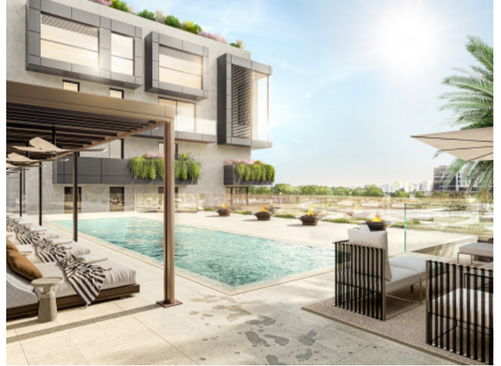
Fantastic pool area