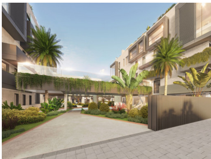
Entrance to the community