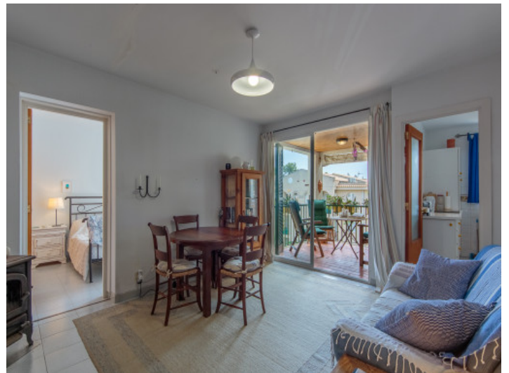
Bright living and dining area