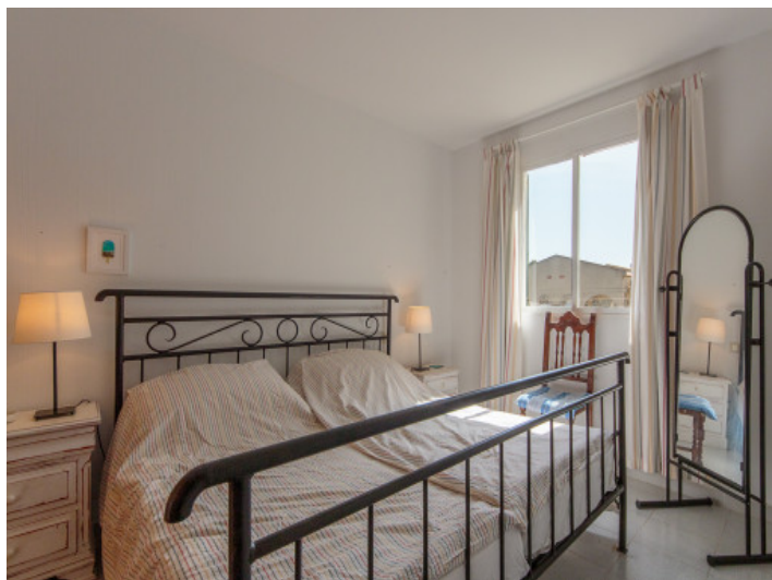
Bright double bedroom