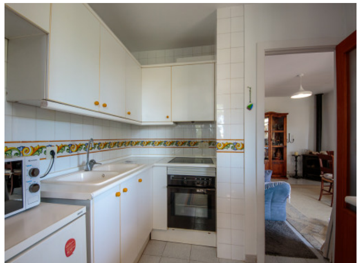
Access to the living area

All information is correct to the best of our knowledge. Errors and prior sale excepted. This prospectus is purely for information purposes. Only the notarized deed of sale is legally binding.