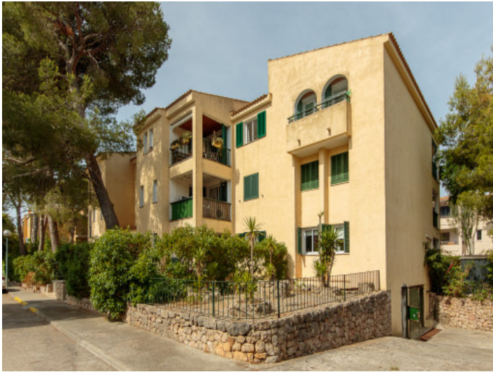
View of the building