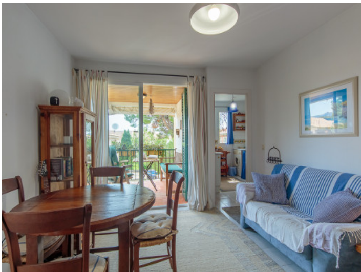
Living and dining area with balcony