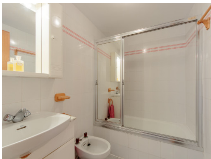
Bathroom with bathtub