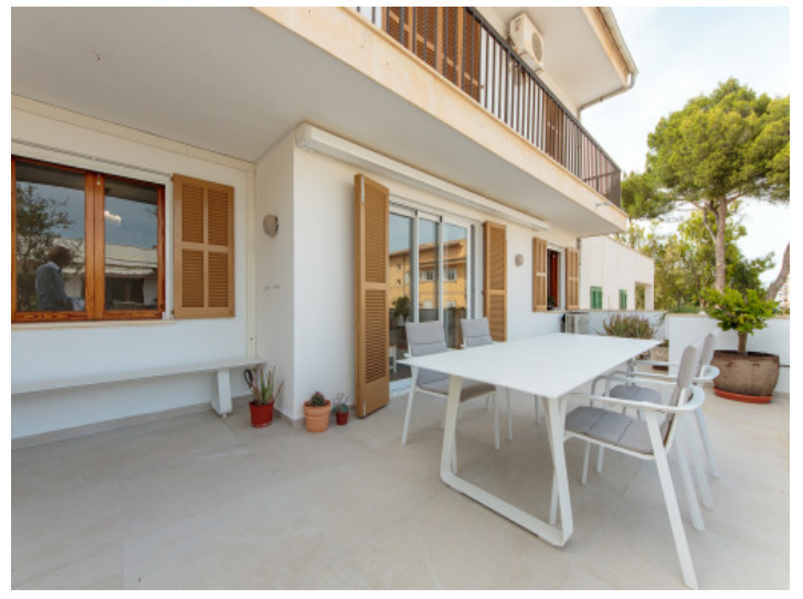
Outdoor dining area