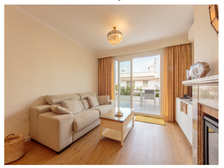
Living area with terrace access