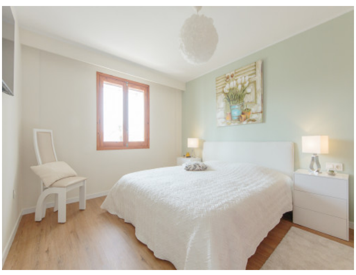
Comfortable double bedroom