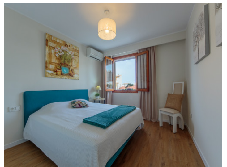
Bedroom with air conditioning and heating Modern shower bathroom All information is correct to the best of our knowledge. Errors and prior sale excepted. This prospectus is purely for information purposes. Only the notarized deed of sale is legally binding.

PORTA MALLORQUINA • THERESIENSTR.: 81, 80333 MUNICH TEL. +34 971 698 242 • INFO@PORTAMALLORQUINA.COM