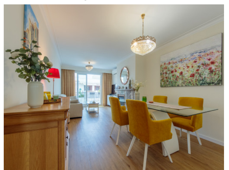
Tastefully decorated living and dining area Open living and dining area All information is correct to the best of our knowledge. Errors and prior sale excepted. This prospectus is purely for information purposes. Only the notarized deed of sale is legally binding.

PORTA MALLORQUINA • THERESIENSTR.: 81, 80333 MUNICH TEL. +34 971 698 242 • INFO@PORTAMALLORQUINA.COM