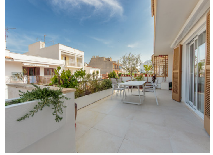
Fanstastic large tarrce

PORTA MALLORQUINA® Your home. Our passion.