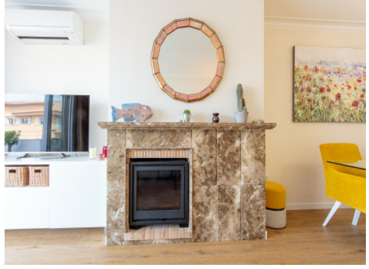
Cosy fireplace for winter days

PORTA MALLORQUINA® Your home. Our passion.