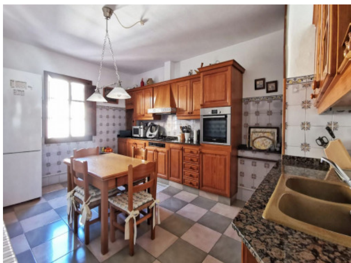
Fully equipped kitchen