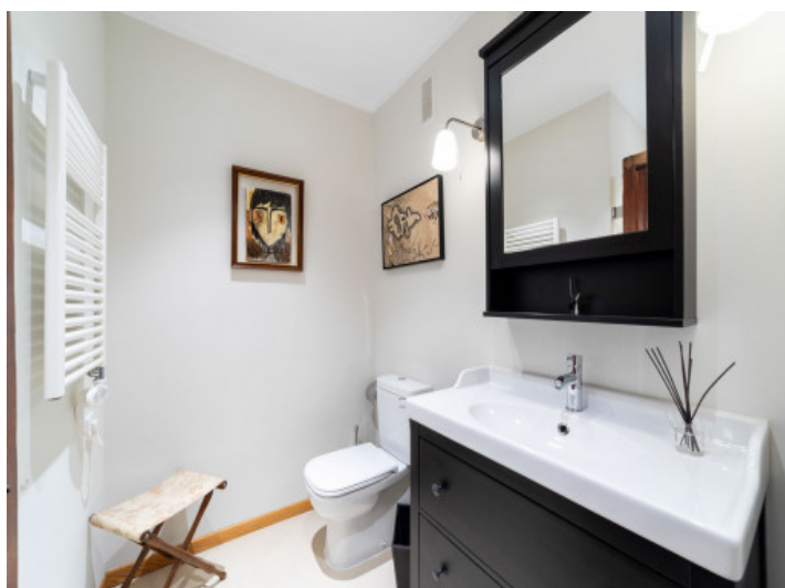
One of 3 bathrooms