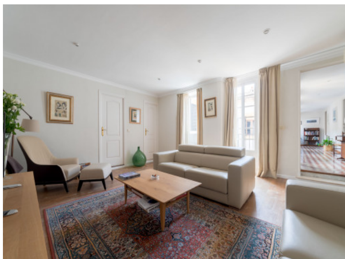
Elegant living area