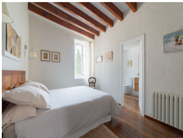
One of 3 bedrooms

All information is correct to the best of our knowledge. Errors and prior sale excepted. This prospectus is purely for information purposes. Only the notarized deed of sale is legally binding.