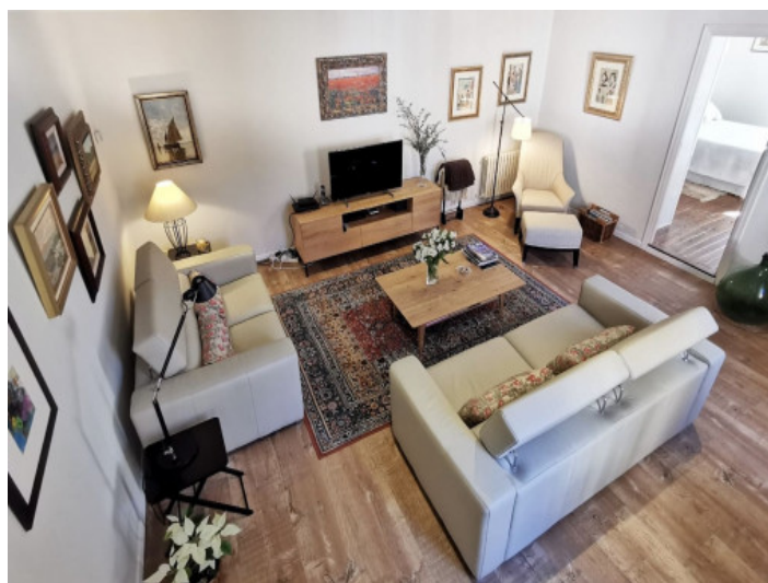
Cosy living area