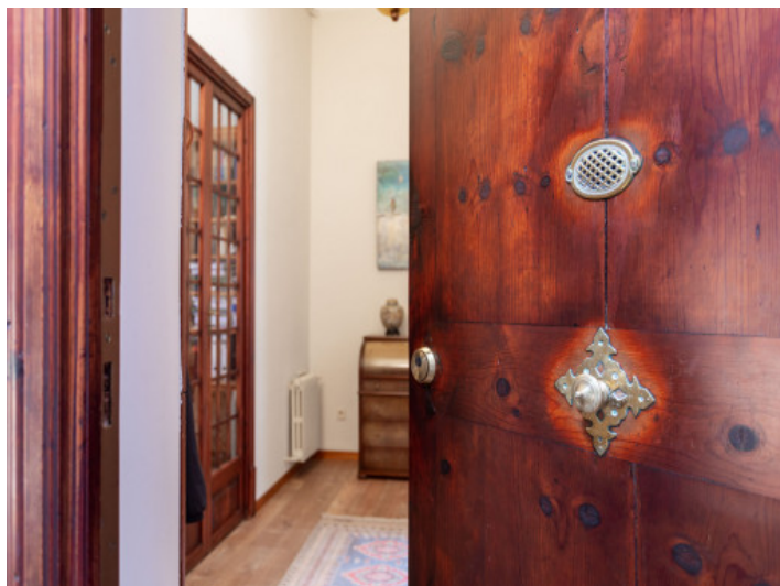
Entrance with lots of character