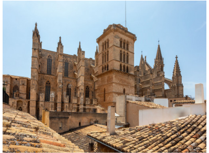
Fantastic view to the cathedral

All information is correct to the best of our knowledge. Errors and prior sale excepted. This prospectus is purely for information purposes. Only the notarized deed of sale is legally binding.