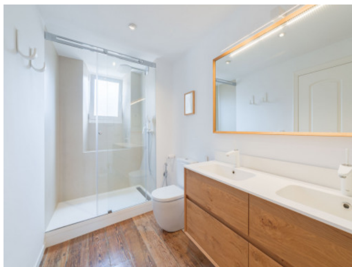
One of 3 bathrooms