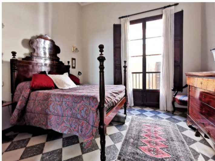
One of 3 bedrooms