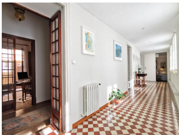
Sunny, spacious flat in Palma with a special Mallorcan character

All information is correct to the best of our knowledge. Errors and prior sale excepted. This prospectus is purely for information purposes. Only the notarized deed of sale is legally binding.