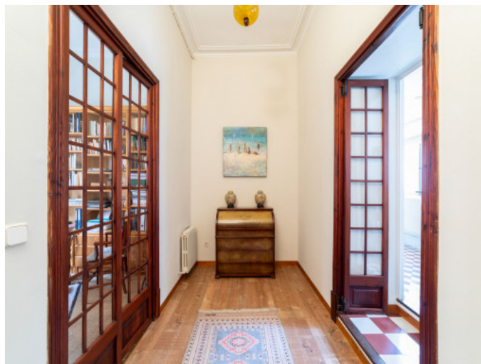
Beautiful entrance area