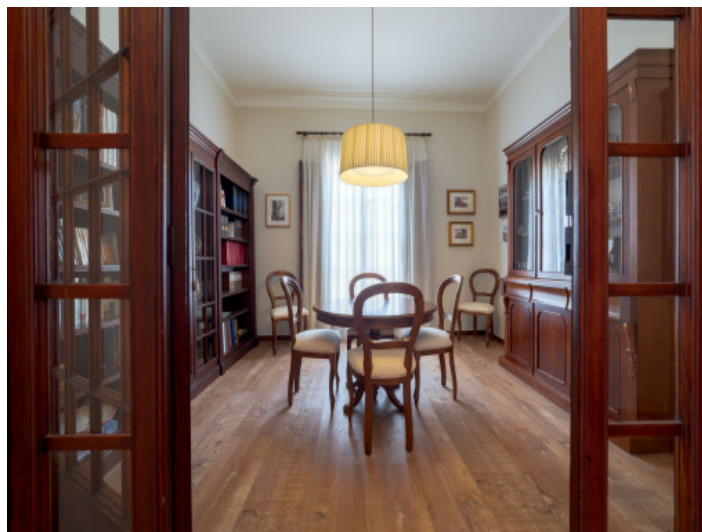
Classic dining area