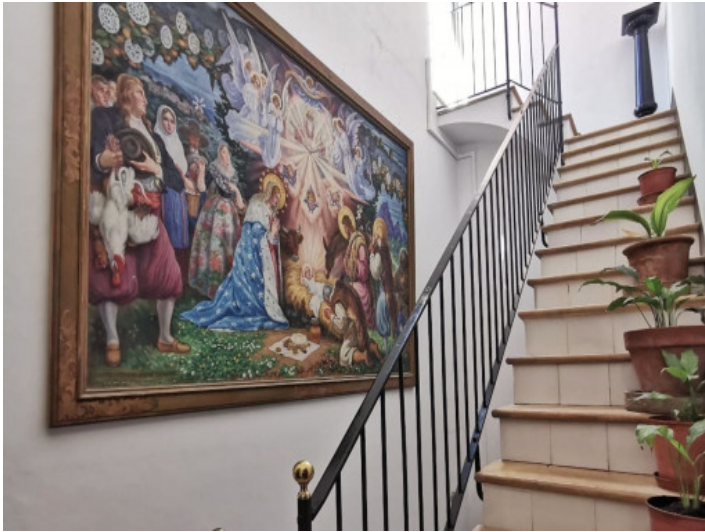
Stairs leading up to the communal terrace