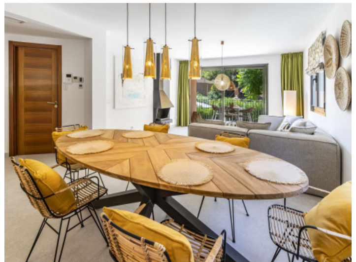
Modern dining area

All information is correct to the best of our knowledge. Errors and prior sale excepted. This prospectus is purely for information purposes. Only the notarized deed of sale is legally binding.