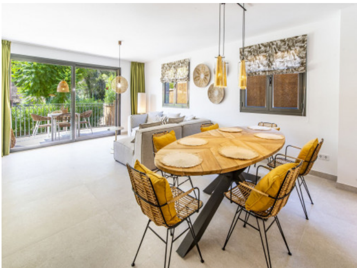
Direct terrace access