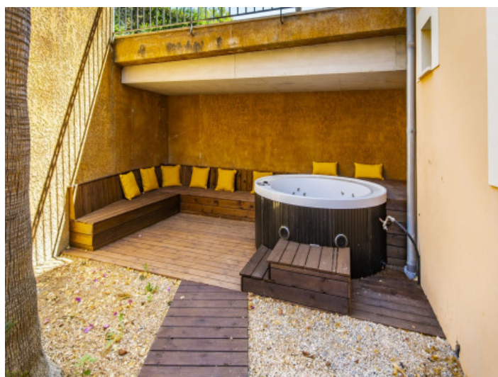
Covered bbq terrace

All information is correct to the best of our knowledge. Errors and prior sale excepted. This prospectus is purely for information purposes. Only the notarized deed of sale is legally binding.