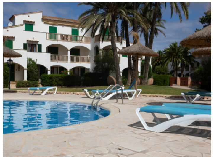
Community pool area

All information is correct to the best of our knowledge. Errors and prior sale excepted. This prospectus is purely for information purposes. Only the notarized deed of sale is legally binding.