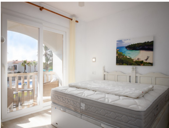
Light flooded bedroom