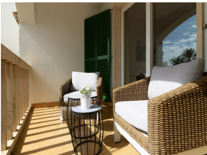
Balcony with chill out lounge