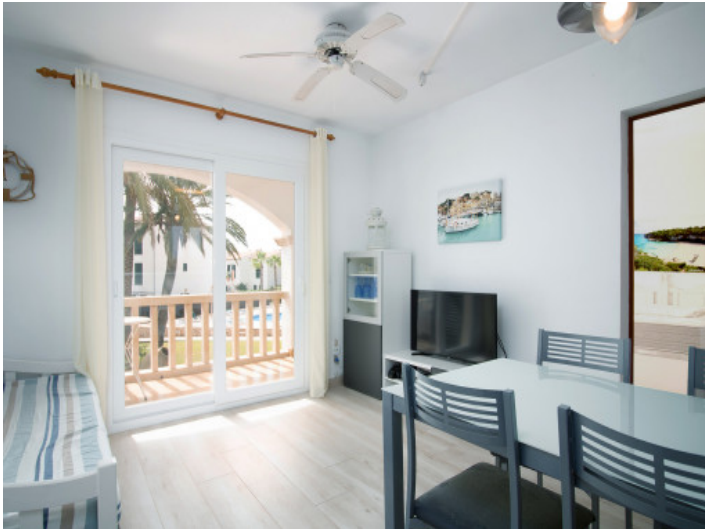
Open living and dining area