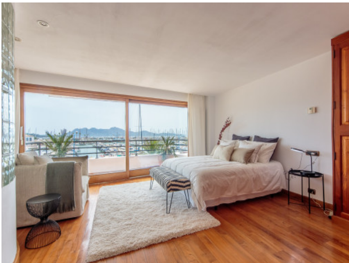
Spacious bedroom with fantastic views