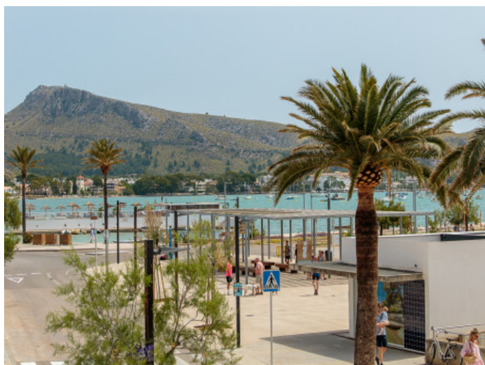
Sea and mountain views