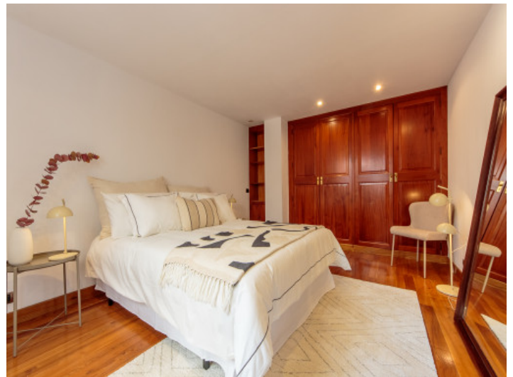
Bedroom with built-in cupboards