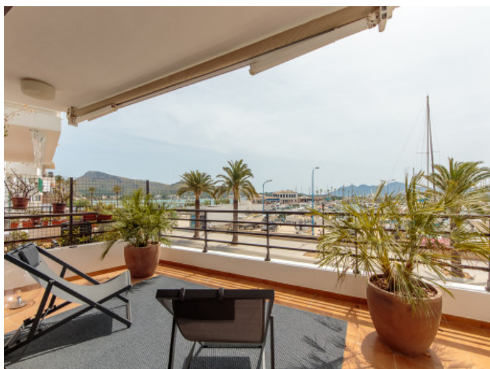
Large terrace with a harbour view