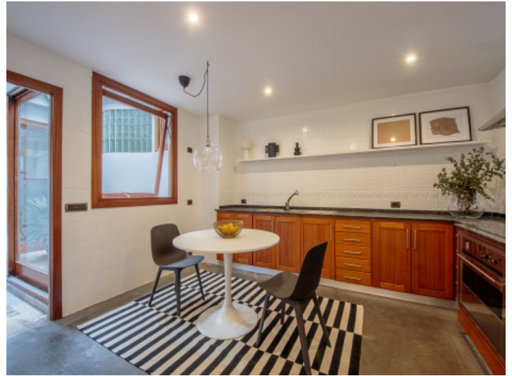
Fully equipped live-in kitchen