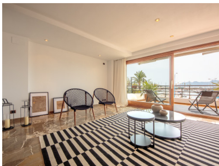
Living area with access to the terrace

All information is correct to the best of our knowledge. Errors and prior sale excepted. This prospectus is purely for information purposes. Only the notarized deed of sale is legally binding.