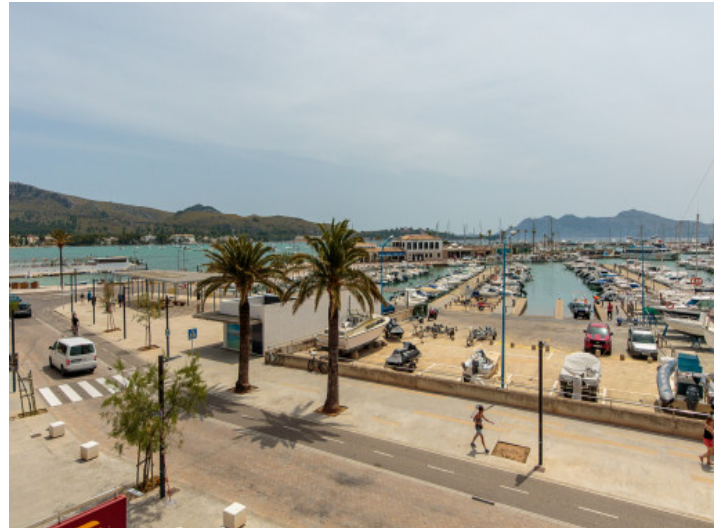
Impressive sea and mountain views

All information is correct to the best of our knowledge. Errors and prior sale excepted. This prospectus is purely for information purposes. Only the notarized deed of sale is legally binding.