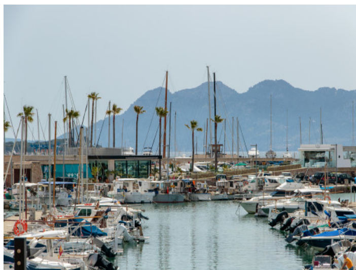
Beautiful harbour view