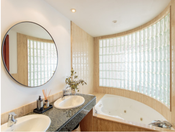
Bright bathroom with bathtub