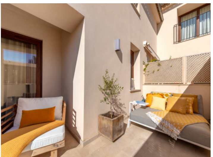
Sunny terrace with seating Partially covered terrace All information is correct to the best of our knowledge. Errors and prior sale excepted. This prospectus is purely for information purposes. Only the notarized deed of sale is legally binding.

PORTA MALLORQUINA • C./ CONQUISTADOR 8, 07001 PALMA TEL. +34 971 698 242 • INFO@PORTAMALLORQUINA.COM