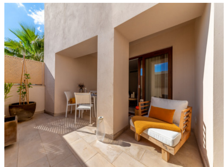
Private terrace with lounge area