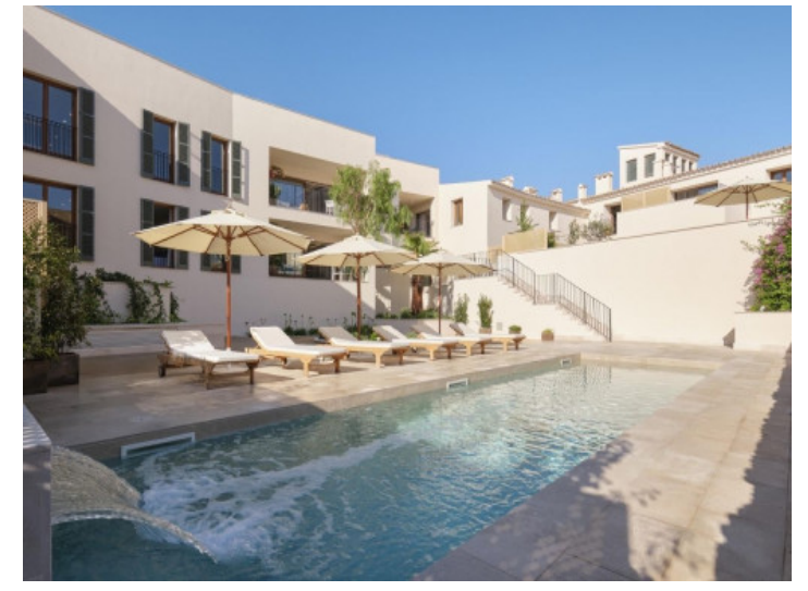
Lovely community pool area

PORTA MALLORQUINA® Your home. Our passion.