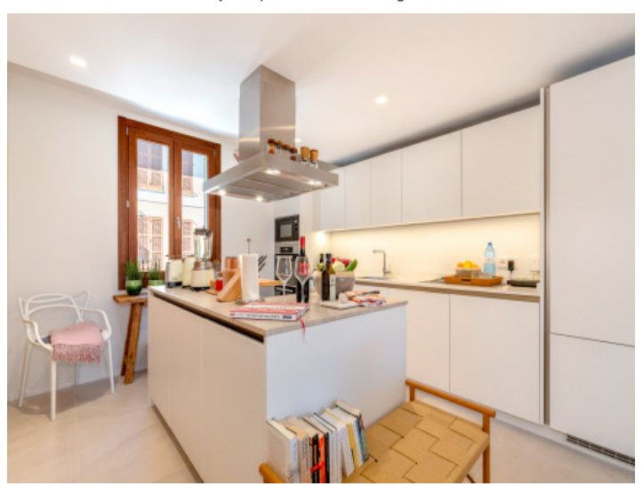
Fully equipped kitchen Kitchen with island All information is correct to the best of our knowledge. Errors and prior sale excepted. This prospectus is purely for information purposes. Only the notarized deed of sale is legally binding.

PORTA MALLORQUINA • C./ CONQUISTADOR 8, 07001 PALMA TEL. +34 971 698 242 • INFO@PORTAMALLORQUINA.COM