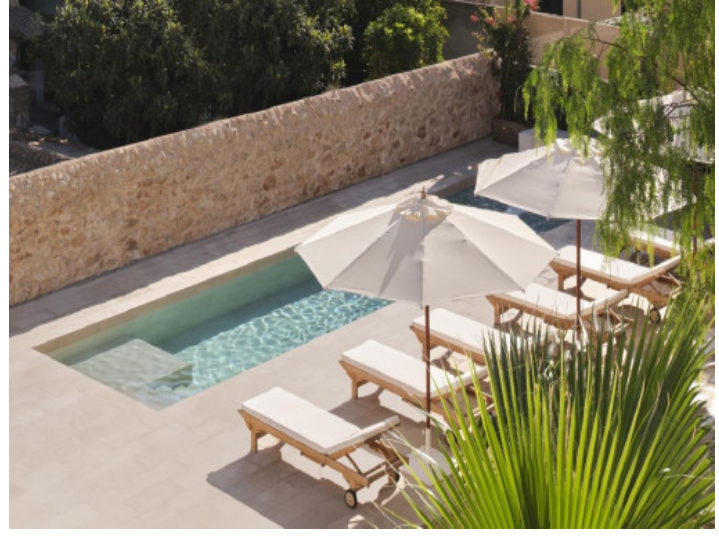
Lovely community pool

PORTA MALLORQUINA<sup>®</sup> Your home. Our passion.