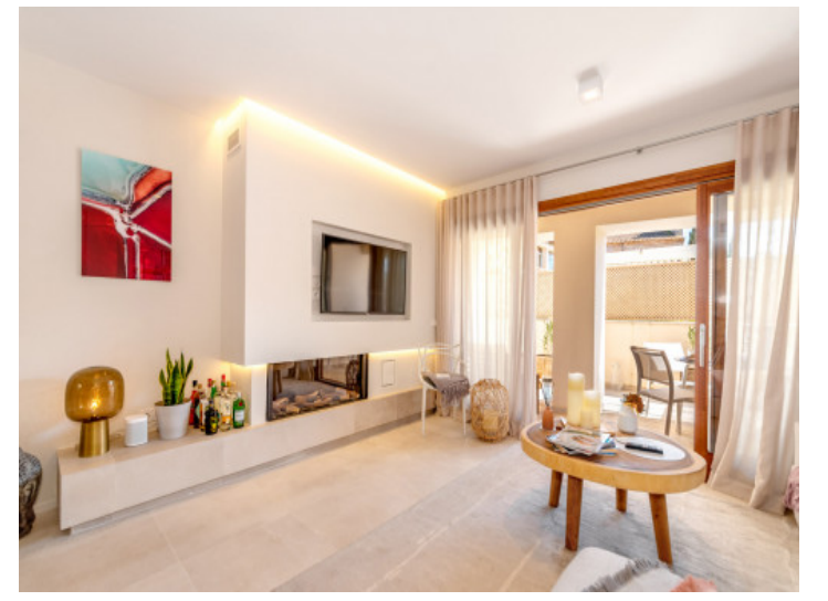
Cozy fireplace in the living room