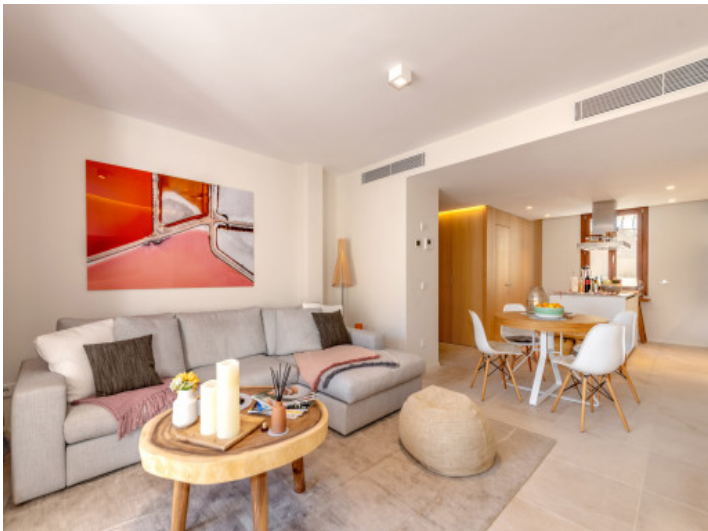
Open plan living and dining room