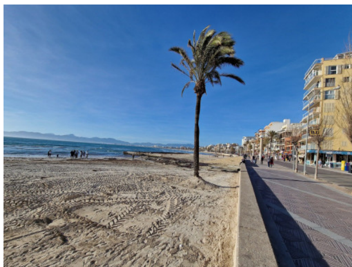
View of the beach

All information is correct to the best of our knowledge. Errors and prior sale excepted. This prospectus is purely for information purposes. Only the notarized deed of sale is legally binding.