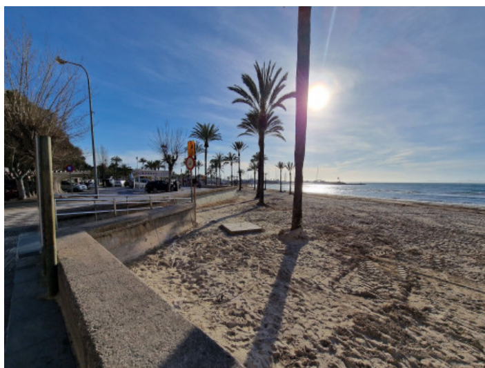
View of the beach