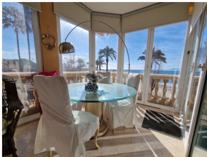
Separate sitting area