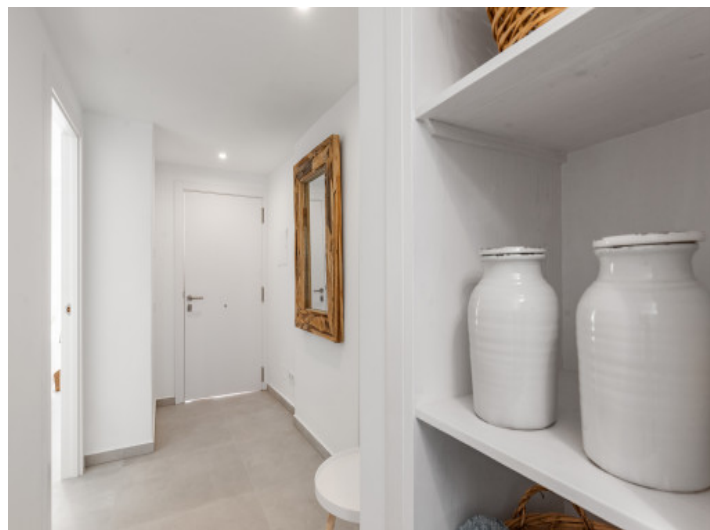
Pleasant entrance area