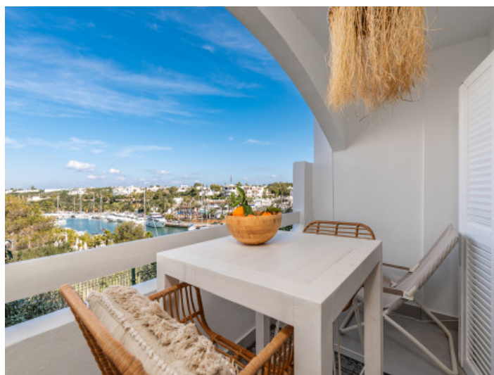
Balcony with fantastic harbour views