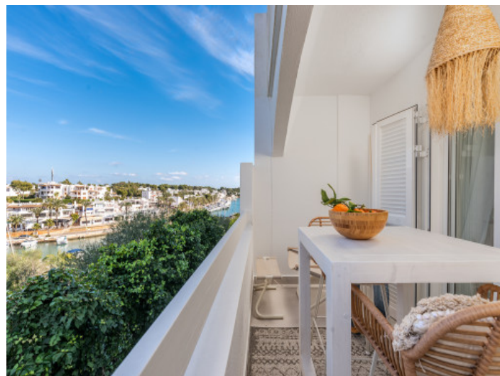
Balcony with sea views