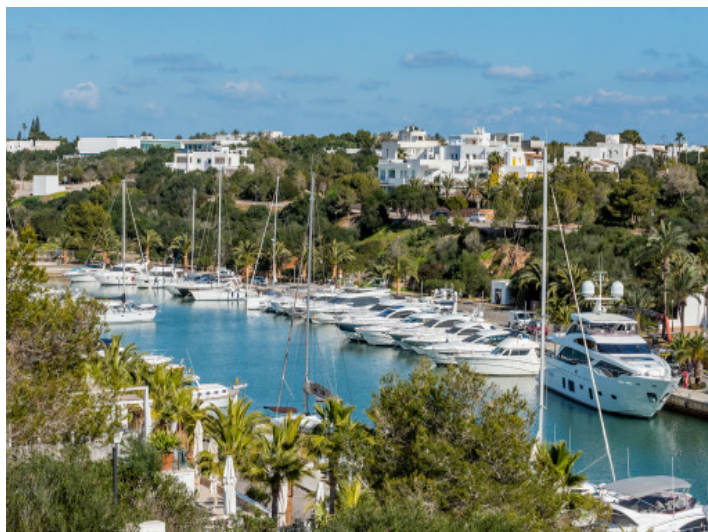
Impressive harbour views