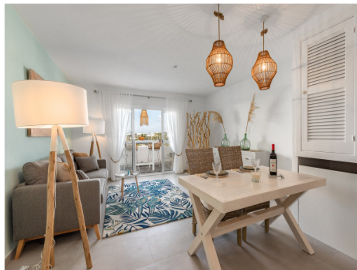
Living area with feel-well ambience