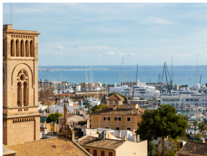
Wonderful views over the bay of Palma