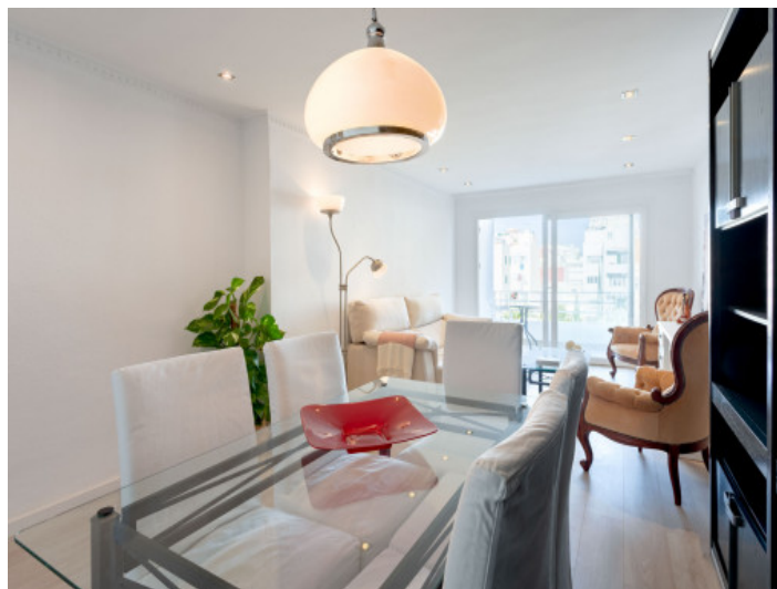
Adjoining dining area