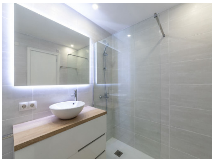
Second shower bathroom

PORTA MALLORQUINA® Your home. Our passion.