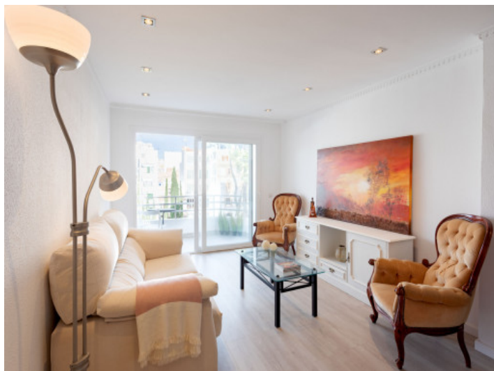
Living area with balcony