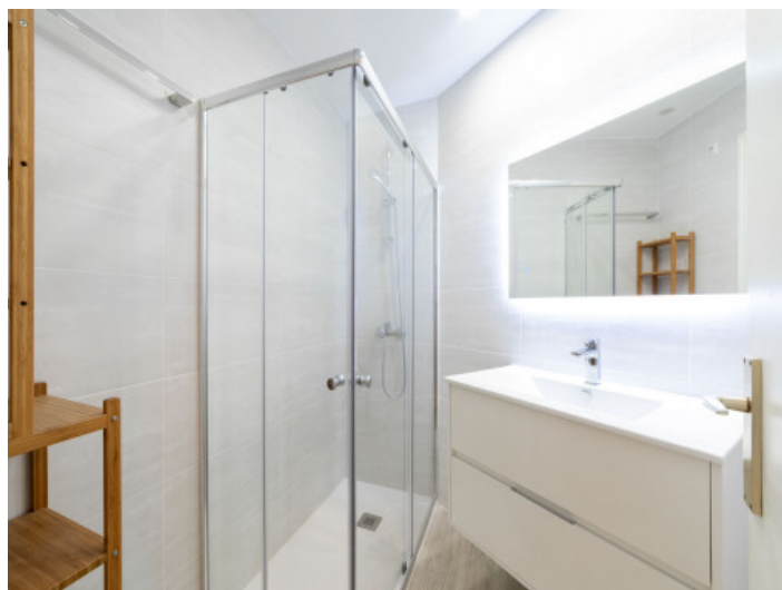
First shower bathroom

All information is correct to the best of our knowledge. Errors and prior sale excepted. This prospectus is purely for information purposes. Only the notarized deed of sale is legally binding.