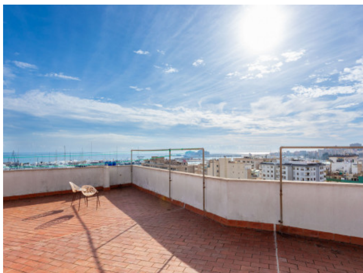
Large sea view roof terrace