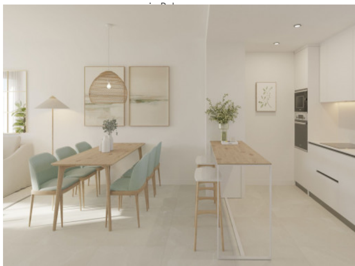
Open living area and kitchen