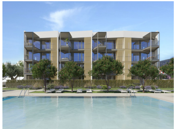
View to the pool

All information is correct to the best of our knowledge. Errors and prior sale excepted. This prospectus is purely for information purposes. Only the notarized deed of sale is legally binding.