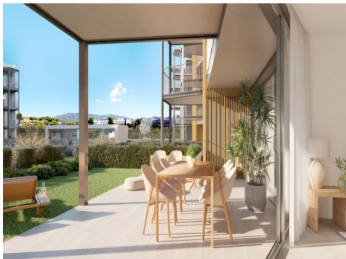
Newly-built 2-bedroom apartment with spacious terrace close to the beach