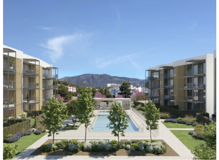
Newly built apartments in Palmanova