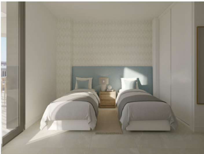
Another cozy bedroom