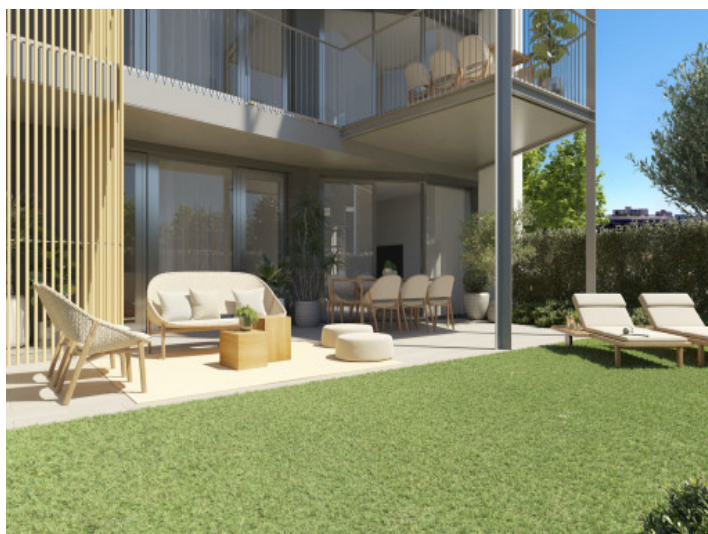
Garden with terrace