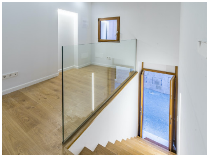
Elegant entrance area