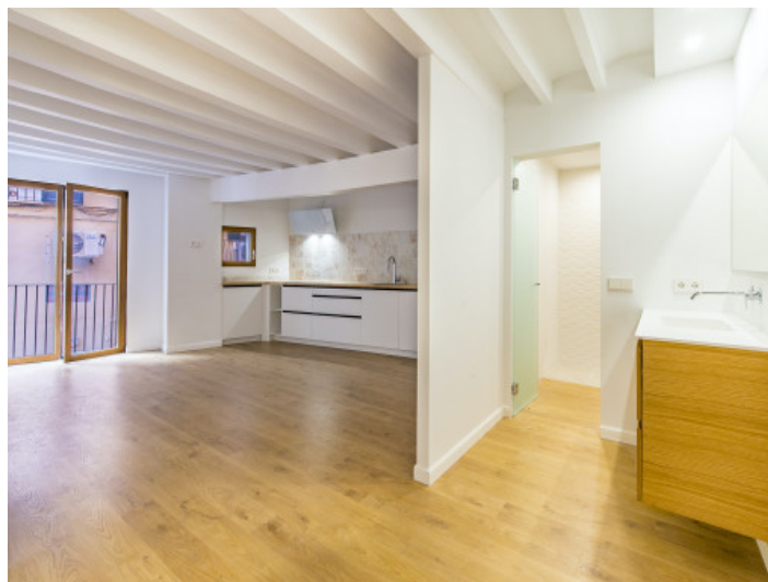
Open living area and kitchen