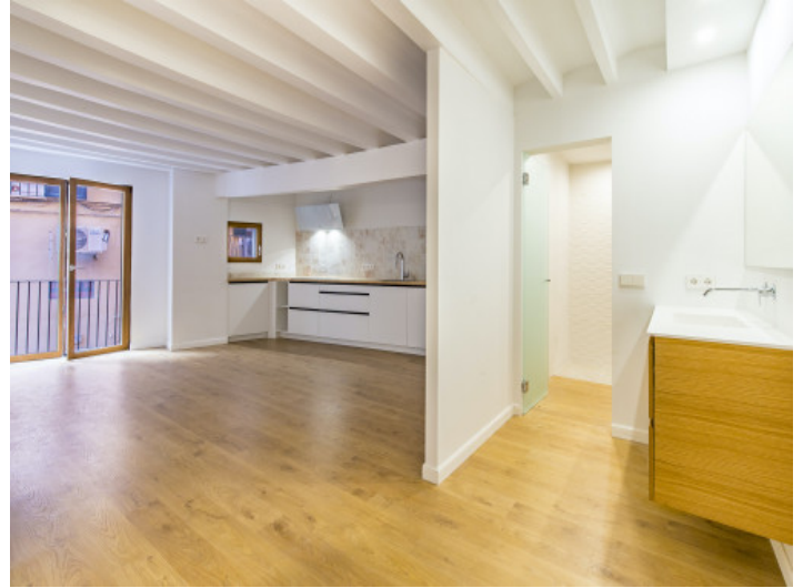
Open living area and kitchen