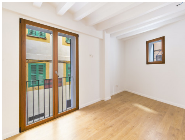
View of the bedroom