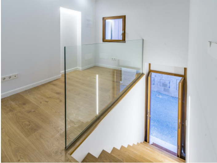
Elegant entrance area