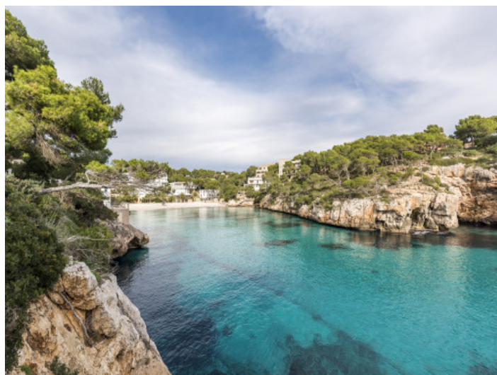
Cristal clear water in the Cala Santanyi

All information is correct to the best of our knowledge. Errors and prior sale excepted. This prospectus is purely for information purposes. Only the notarized deed of sale is legally binding.