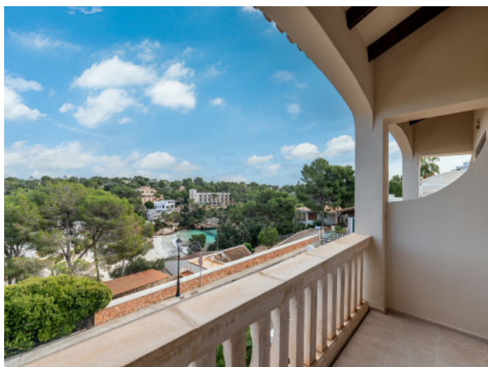
Views from the balcony