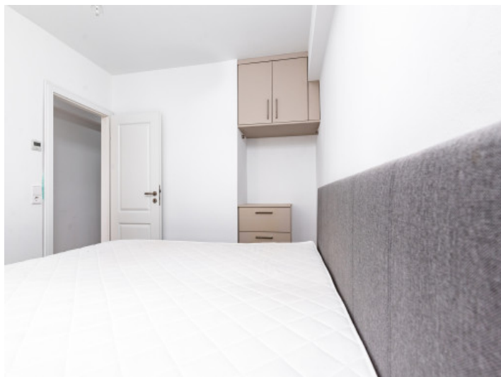
Alternative view of the bedroom