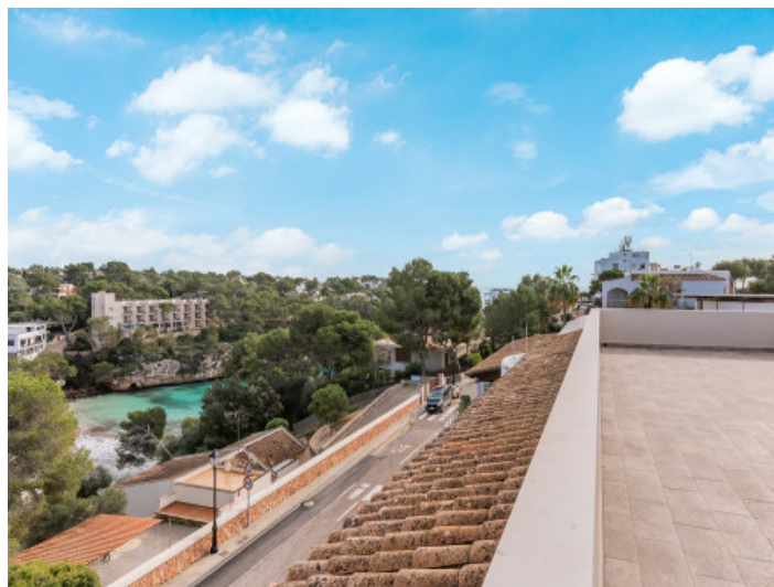
Large roof top terrace