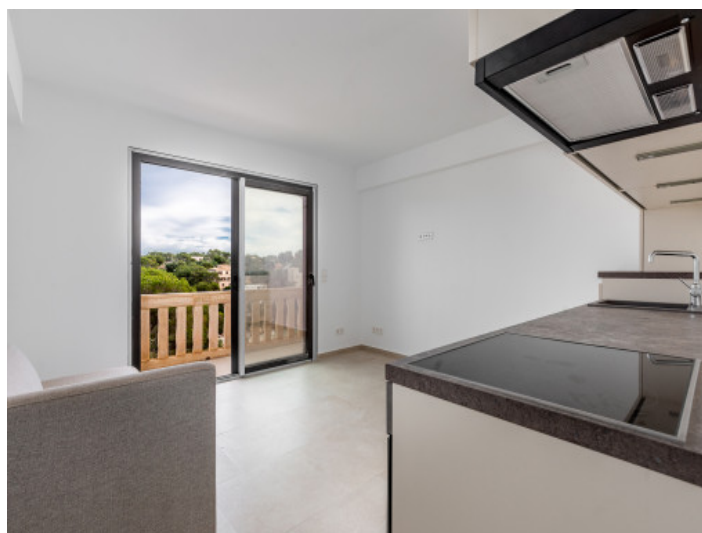
Open living area with kitchen