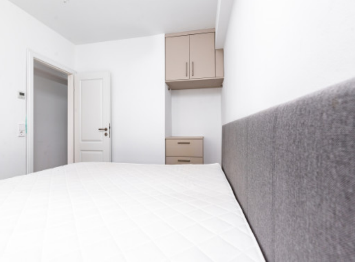
Alternative view of the bedroom

All information is correct to the best of our knowledge. Errors and prior sale excepted. This prospectus is purely for information purposes. Only the notarized deed of sale is legally binding.