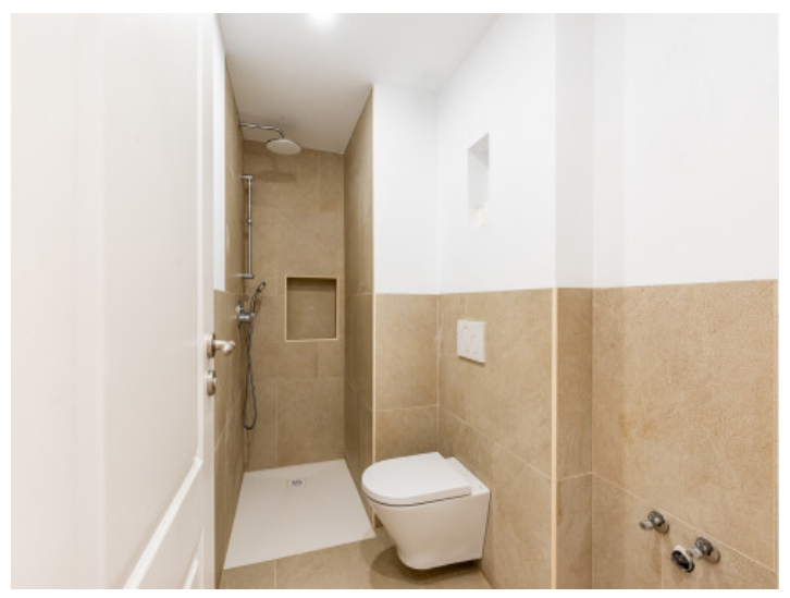
Noble bathroom with walk-in shower