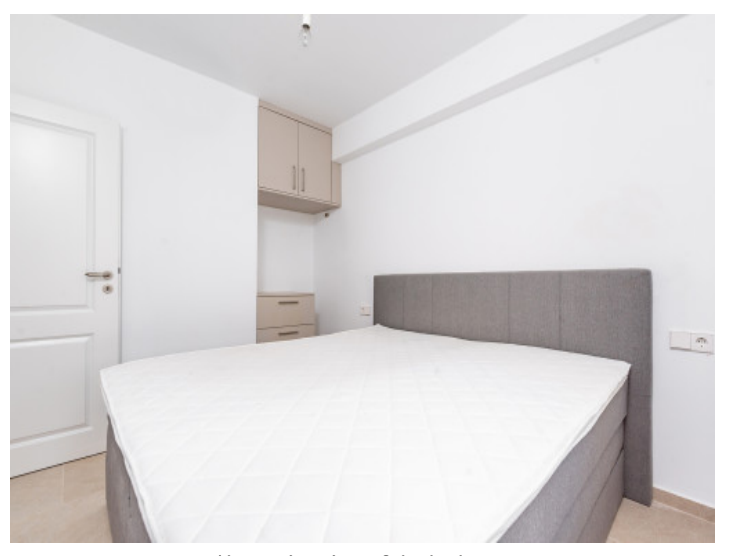
Alternative view of the bedroom

All information is correct to the best of our knowledge. Errors and prior sale excepted. This prospectus is purely for information purposes. Only the notarized deed of sale is legally binding.