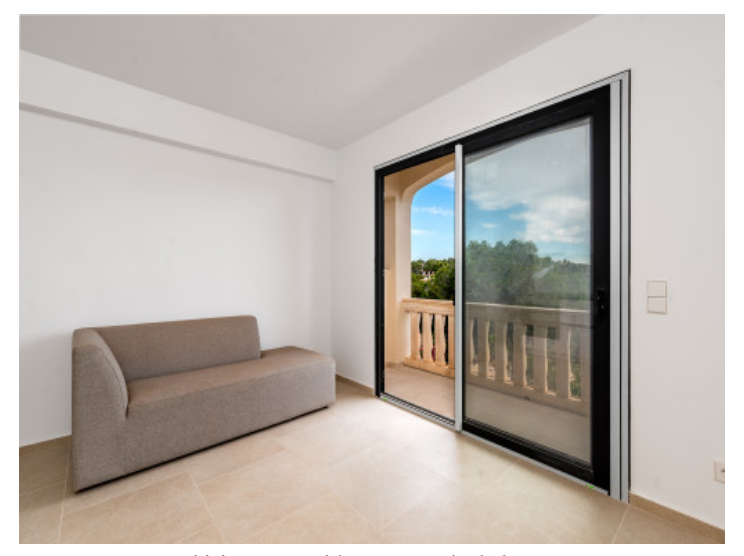
Living room with access to the balcony