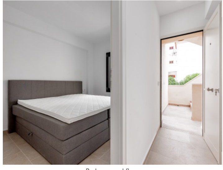
Bedroom and floor