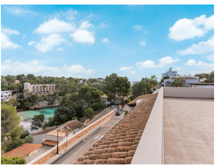
Large roof top terrace