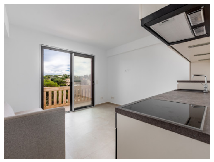
Open living area with kitchen