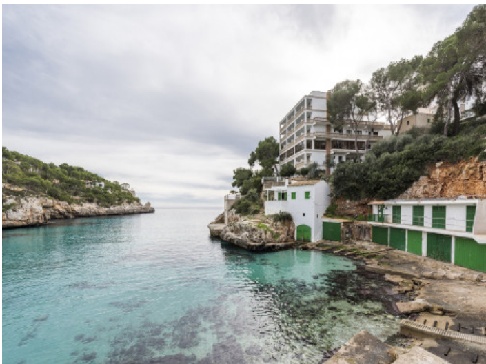
The bay Cala Santanyi