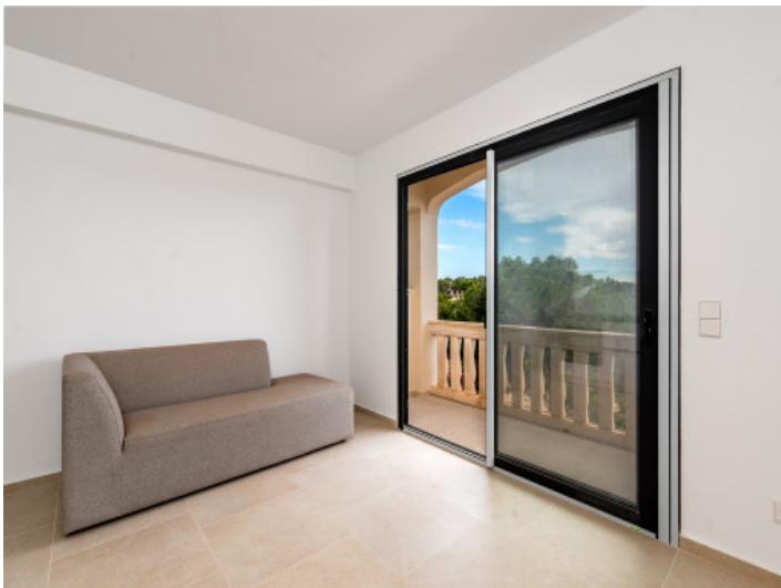
Living room with access to the balcony