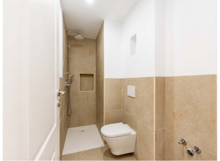
Noble bathroom with walk-in shower