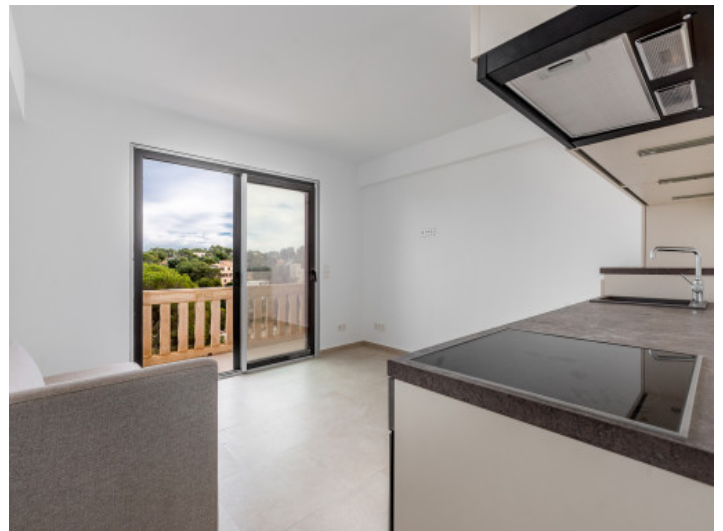
Open living area with kitchen