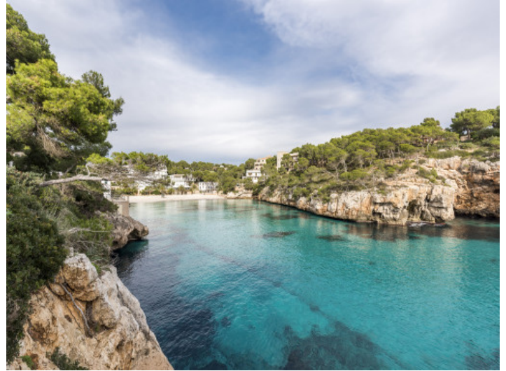
Cristal clear water in the Cala Santanyi