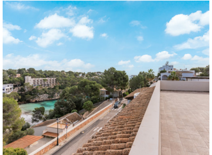
Large roof top terrace