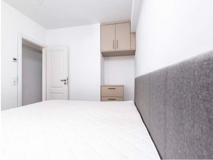
Alternative view of the bedroom