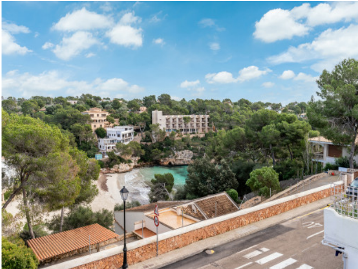
View to the bay Cala Santanyi