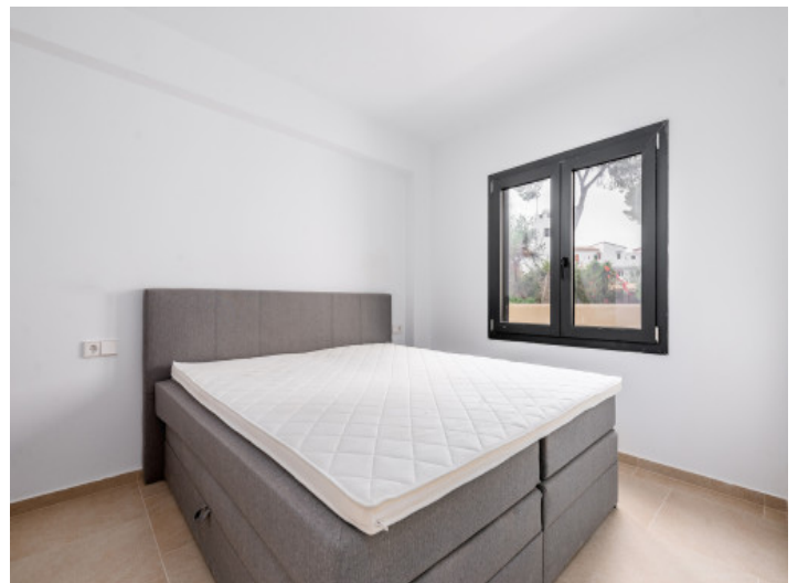
Bright double bedroom

All information is correct to the best of our knowledge. Errors and prior sale excepted. This prospectus is purely for information purposes. Only the notarized deed of sale is legally binding.