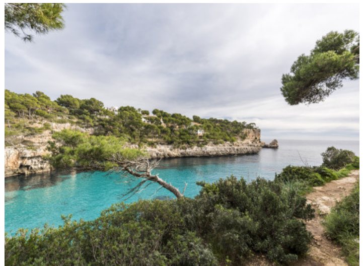
View to the sea

All information is correct to the best of our knowledge. Errors and prior sale excepted. This prospectus is purely for information purposes. Only the notarized deed of sale is legally binding.