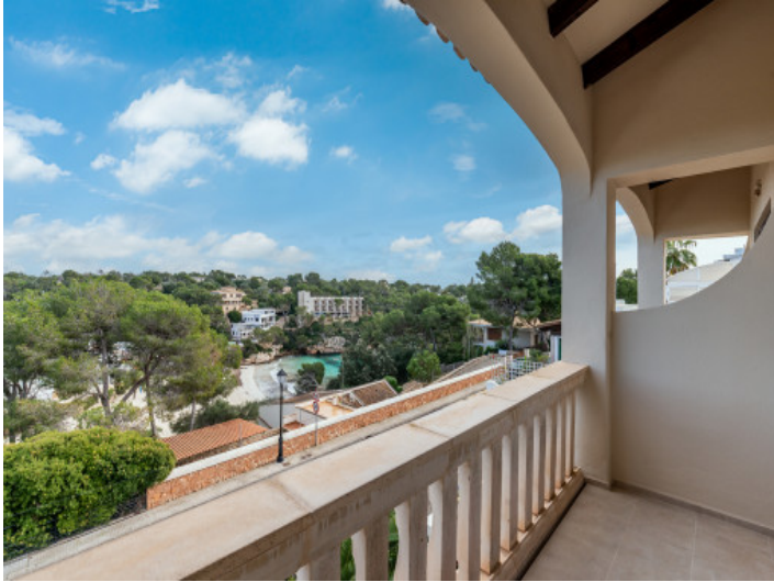
Views from the balcony