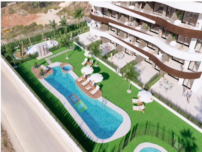
Complex and pool area