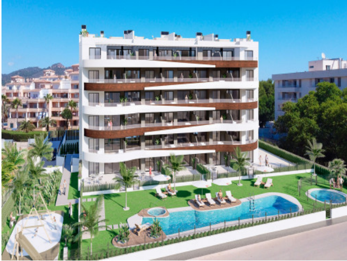
Apartment in a new complex with pool in Sa Coma