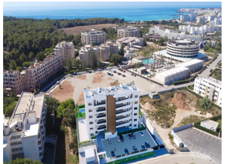
View from above