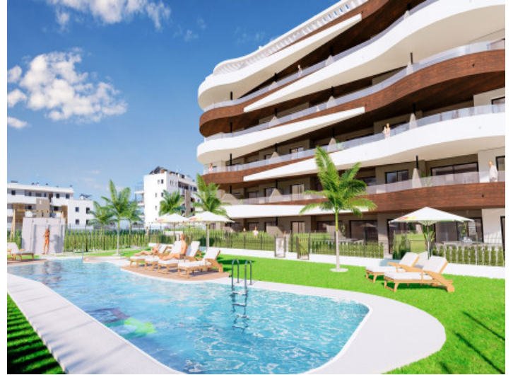
Complex and pool area