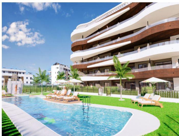
Complex and pool

All information is correct to the best of our knowledge. Errors and prior sale excepted. This prospectus is purely for information purposes. Only the notarized deed of sale is legally binding.