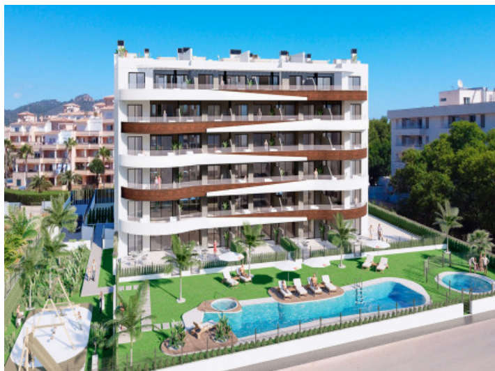
Complex and pool