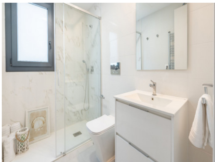
Flat with 2 bathrooms