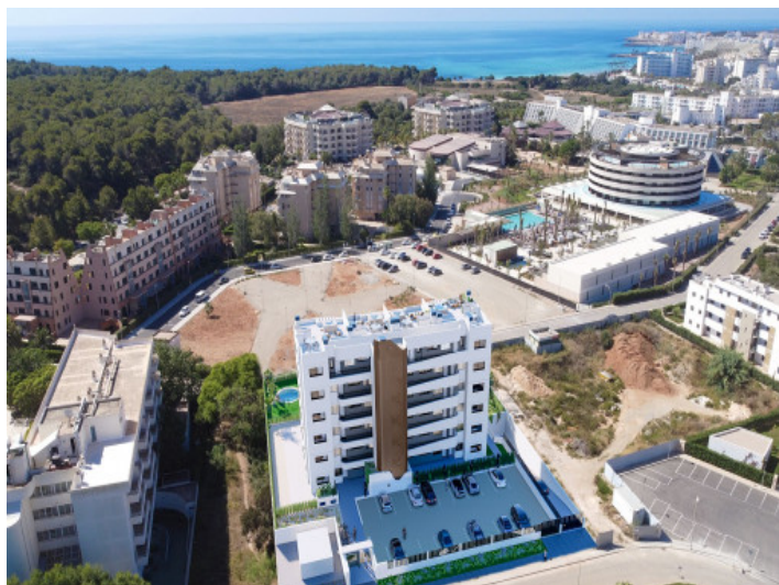
Vista desde arriba