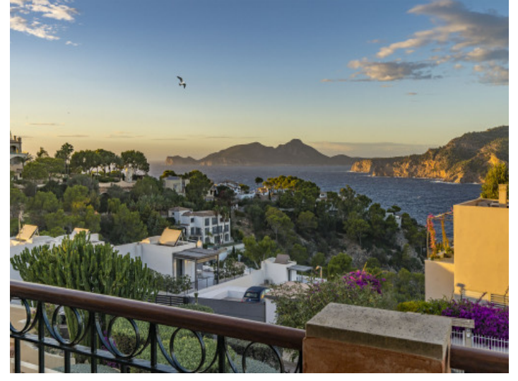
Wonderful evening views from the penthouse in Port Andratx