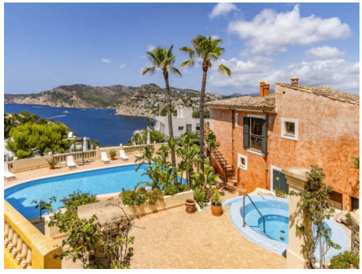
Inviting community pool area