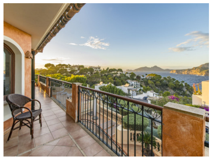
Wonderful sunset from the balcony