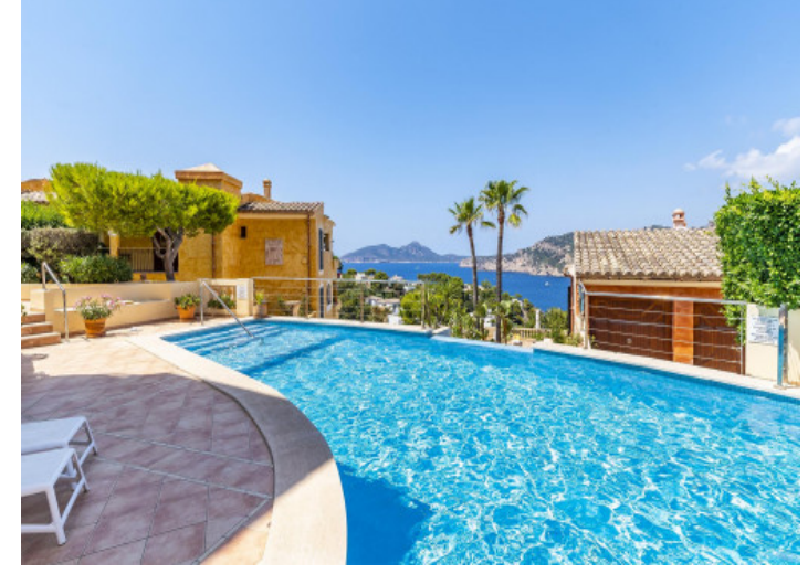
Pool with a view