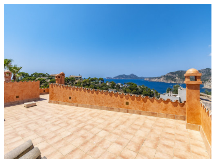
Sonny rooftop terrace Balcony with dining area All information is correct to the best of our knowledge. Errors and prior sale excepted. This prospectus is purely for information purposes. Only the notarized deed of sale is legally binding.