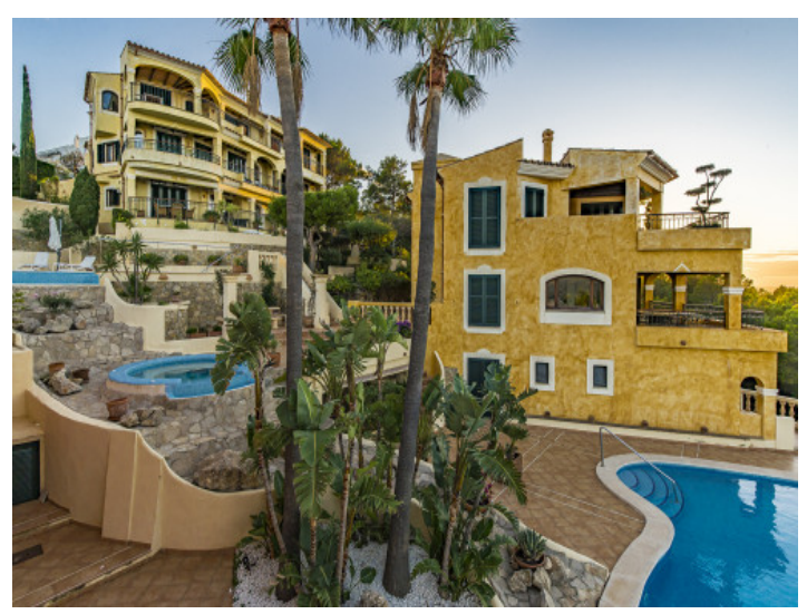
View over the pool Complex and outdoor area All information is correct to the best of our knowledge. Errors and prior sale excepted. This prospectus is purely for information purposes. Only the notarized deed of sale is legally binding.

PORTA MALLORQUINA • THERESIENSTR.: 81, 80333 MUNICH TEL. +34 971 698 242 • INFO@PORTAMALLORQUINA.COM