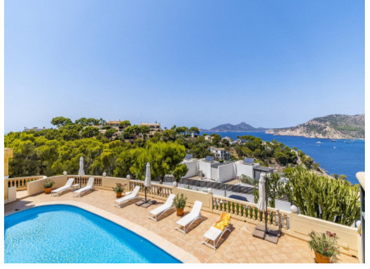
View over the pool and the sea