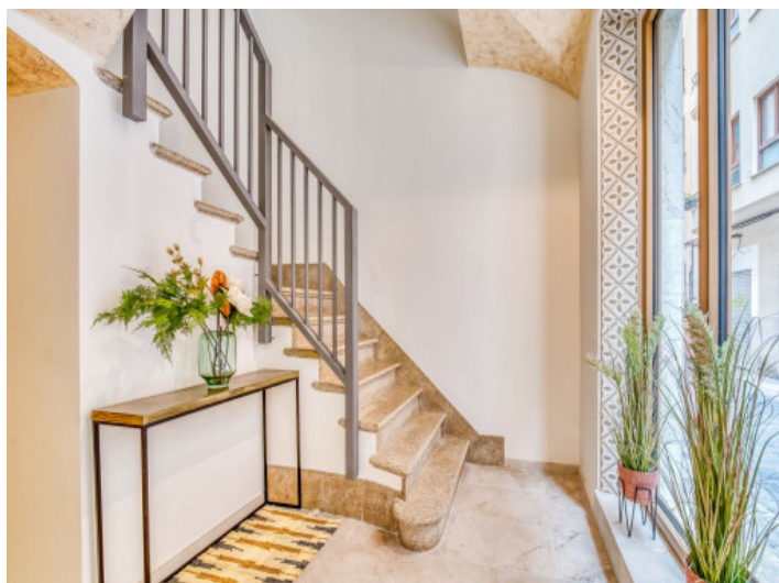
Staircase of the building