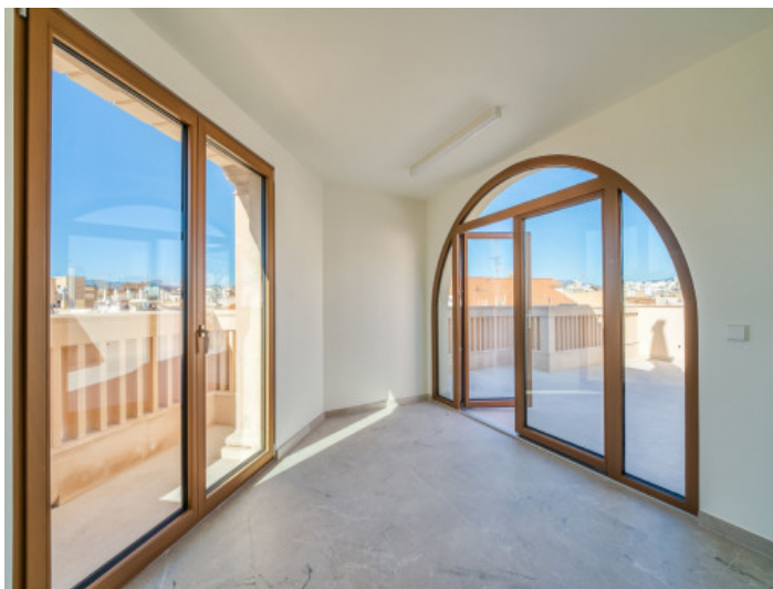
Room close to the rooftop