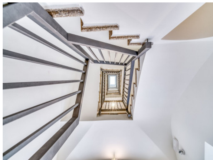
Staircase of the building

All information is correct to the best of our knowledge. Errors and prior sale excepted. This prospectus is purely for information purposes. Only the notarized deed of sale is legally binding.