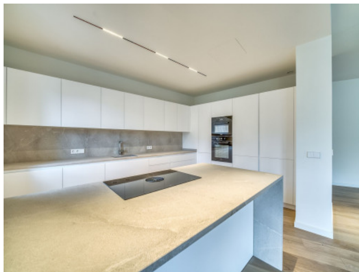
Kitchen with cooking island