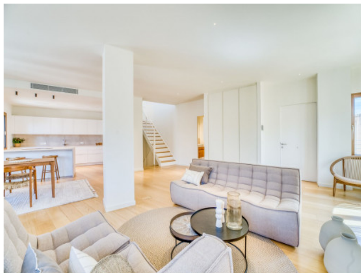
Comfortable living area