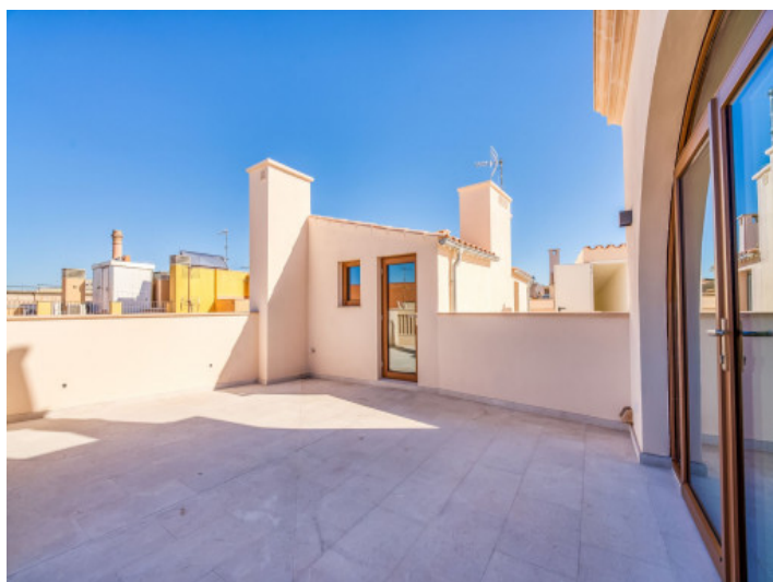
Large rooftop terrace