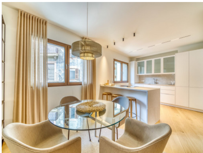
Elegant dining area