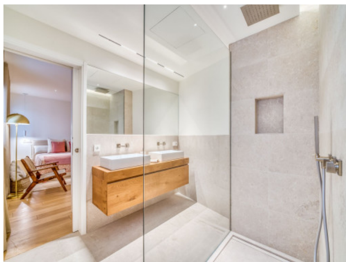
Bathroom with walk - in shower