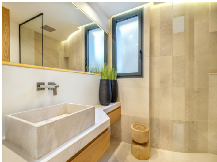
Badezimmer Grup Vial

All information is correct to the best of our knowledge. Errors and prior sale excepted. This prospectus is purely for information purposes. Only the notarized deed of sale is legally binding.