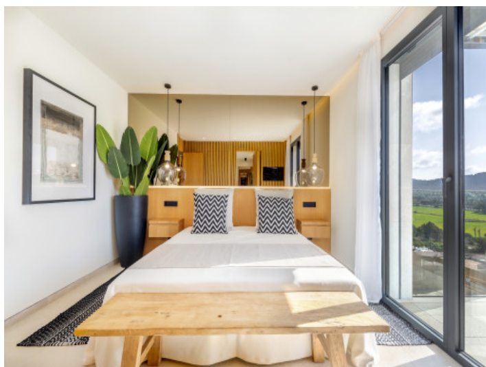
Eines von 4 Schlafzimmer