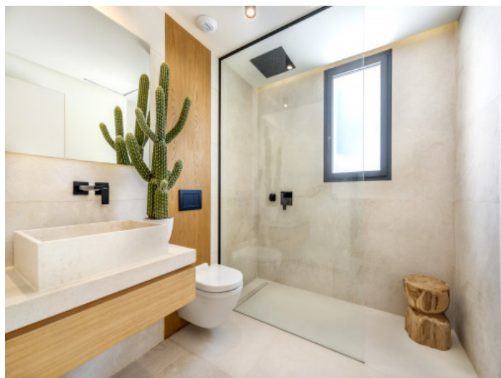
Badezimmer 2 Grup Vial

All information is correct to the best of our knowledge. Errors and prior sale excepted. This prospectus is purely for information purposes. Only the notarized deed of sale is legally binding.