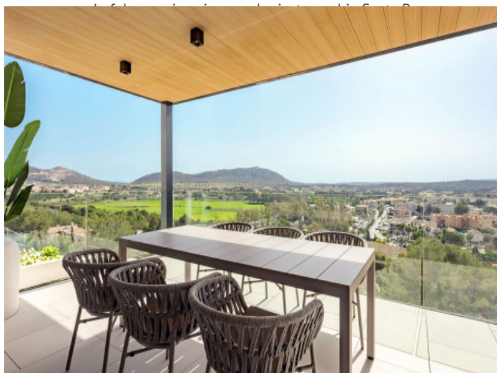
Large covered terrace