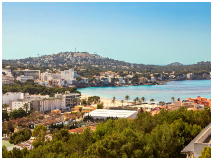
Modern penthouse-apartment in a newly-built residential complex with