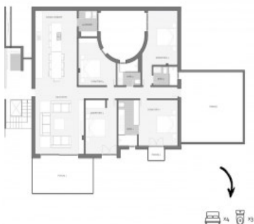
Grundriss Planta 1