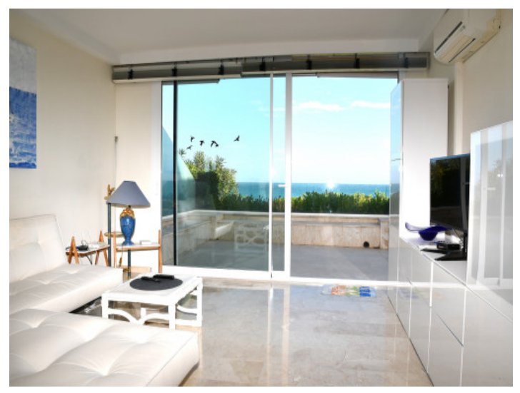
Living area with direct access