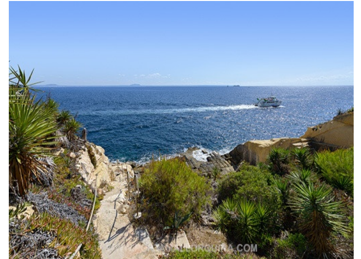
Direct access to the sea