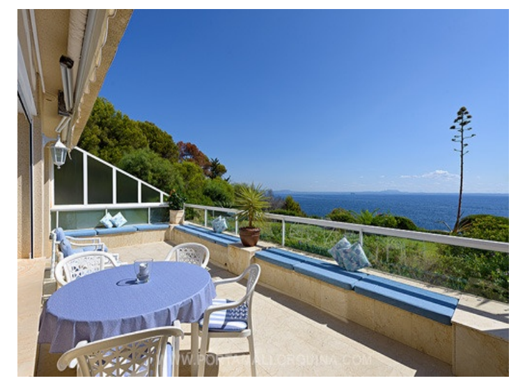
Sea view terrace