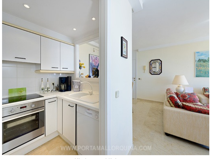
Kitchen and living area

All information is correct to the best of our knowledge. Errors and prior sale excepted. This prospectus is purely for information purposes. Only the notarized deed of sale is legally binding.