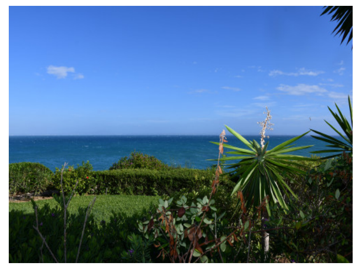
View from terrace