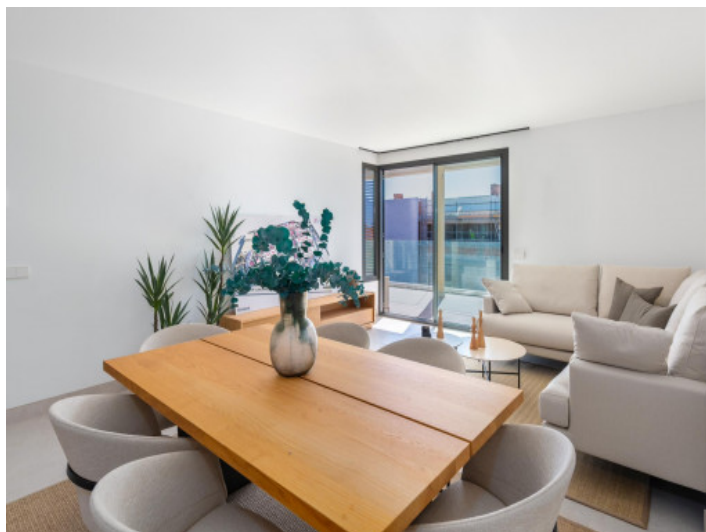
Newly-built apartments with community pool in Sa Ràpita