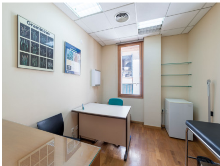
View of the flat

All information is correct to the best of our knowledge. Errors and prior sale excepted. This prospectus is purely for information purposes. Only the notarized deed of sale is legally binding.