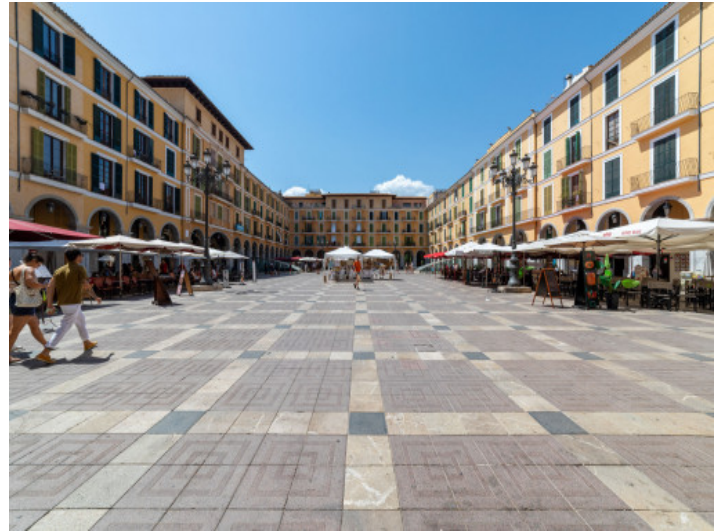
Surroundings of the flat

All information is correct to the best of our knowledge. Errors and prior sale excepted. This prospectus is purely for information purposes. Only the notarized deed of sale is legally binding.