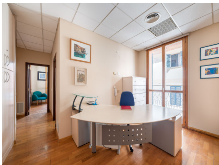
View of the flat