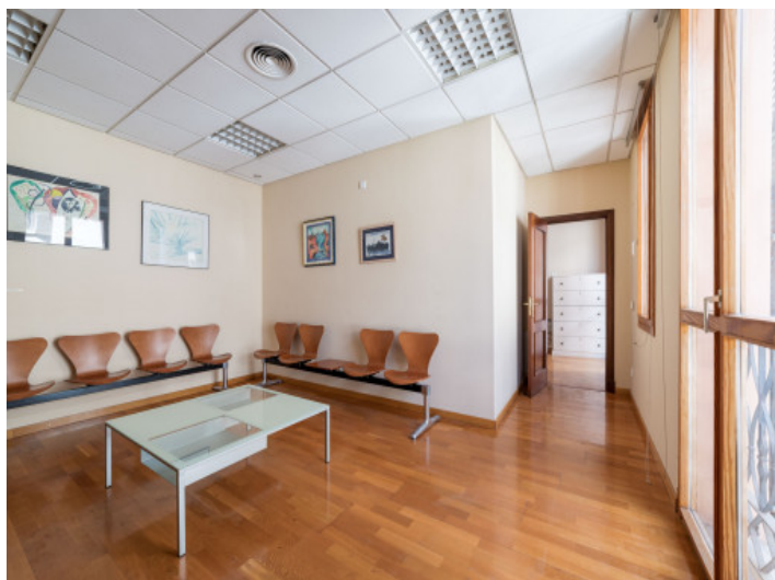
View of the flat