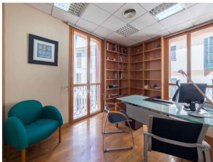
View of the flat