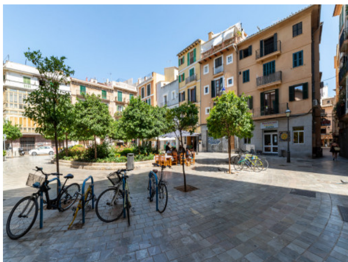
Surroundings of the flat