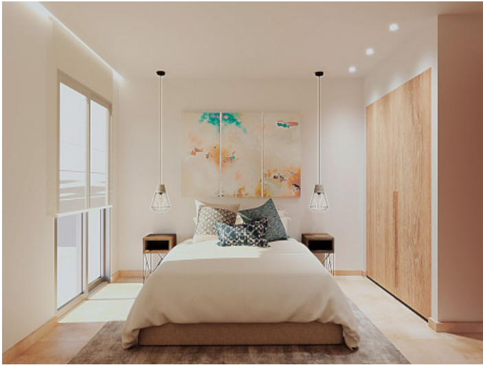
Cozy double bedroom