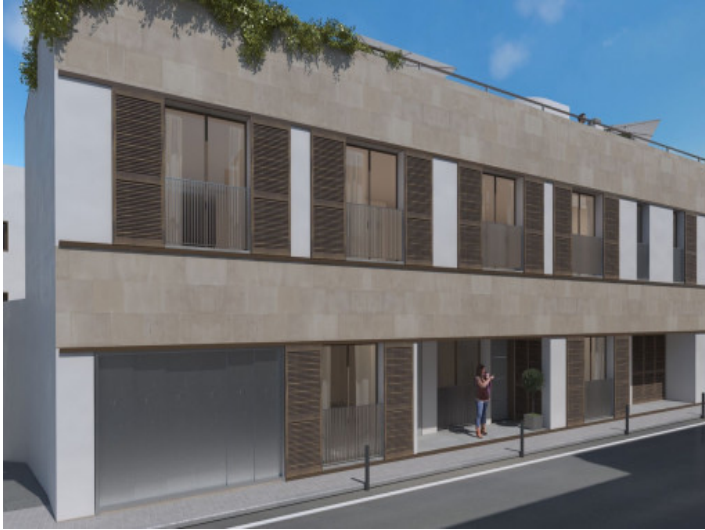
Exterior view of the residential building

All information is correct to the best of our knowledge. Errors and prior sale excepted. This prospectus is purely for information purposes. Only the notarized deed of sale is legally binding.