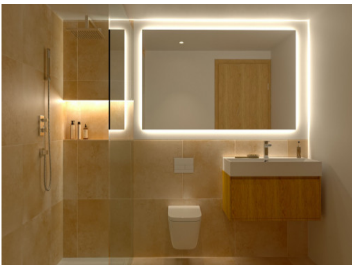
Bathroom with shower