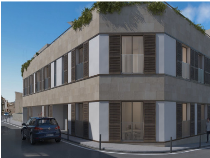
Ground floor apartment in Palma