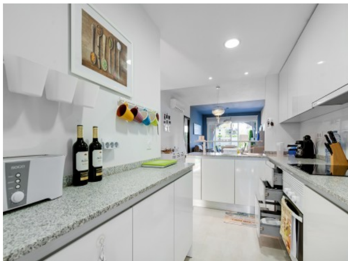
Fully equipped kitchen