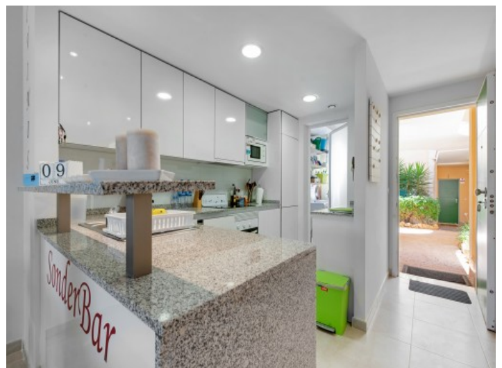
Fully equipped kitchen

All information is correct to the best of our knowledge. Errors and prior sale excepted. This prospectus is purely for information purposes. Only the notarized deed of sale is legally binding.