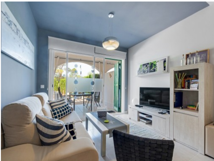
Open living and dining area