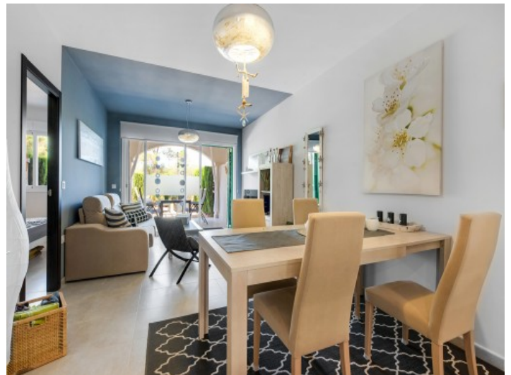
Open living and dining area