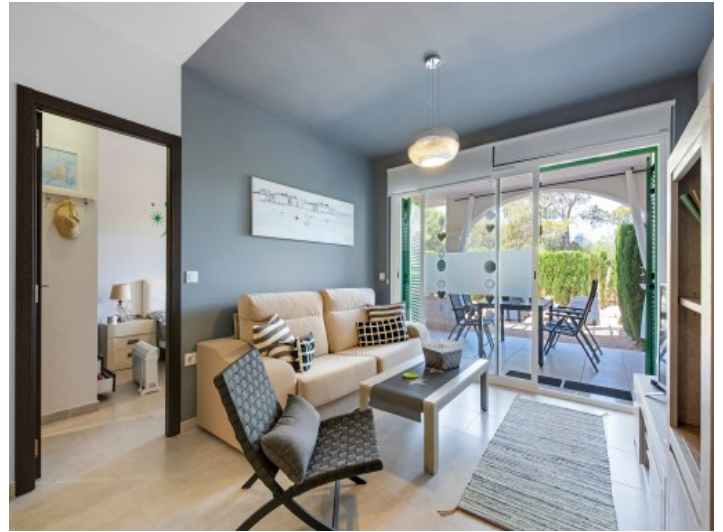
Open living and dining area