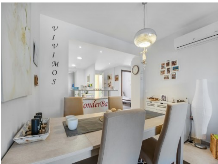
Open living and dining area