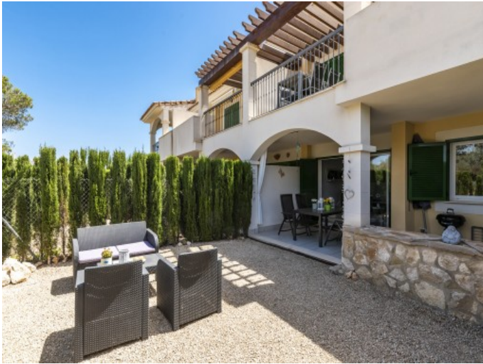
Large garden area