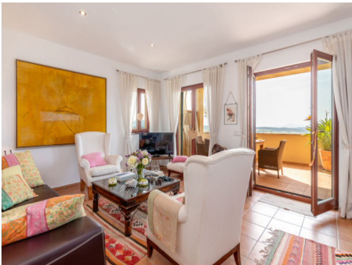
Comfortable living area with terrace access