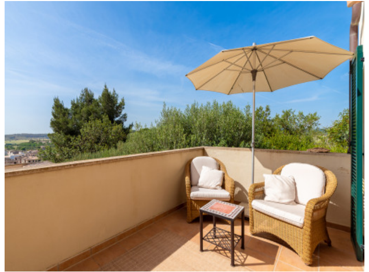
Lovely terrace with seating area