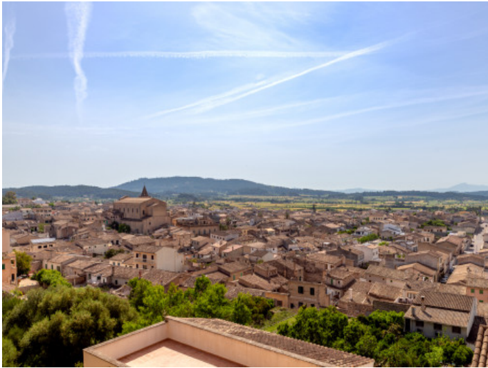
Stunning views over the town