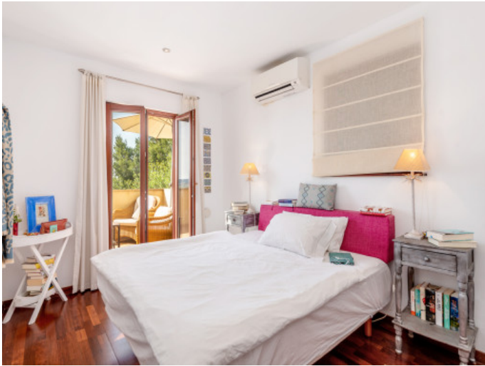
Double bedroom with terrace