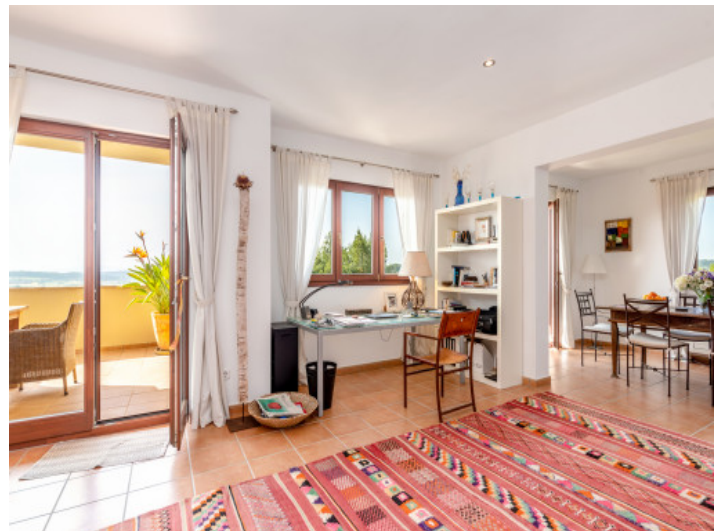
Lightflooded, open living and dining area