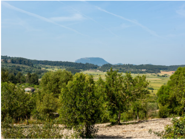
Unobstructed views over the surrounding nature