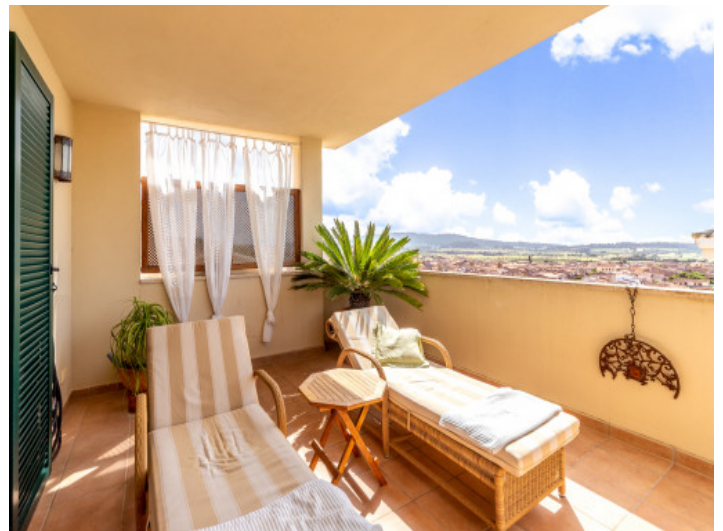
Tranquil lounge terrace