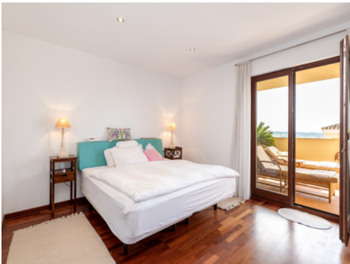
Second double bedroom