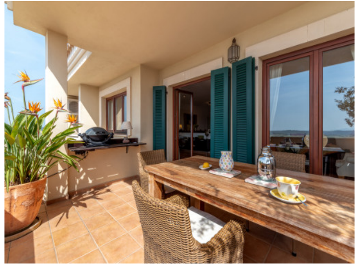
Covered terrace with dining area