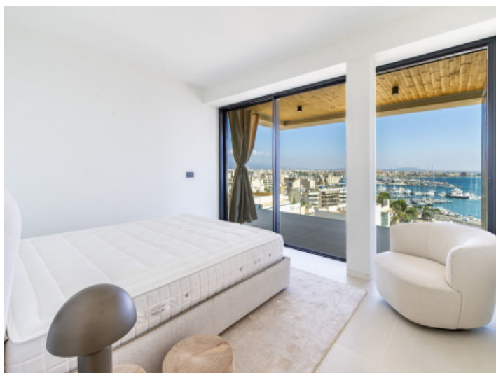
Penthouse with 3 bedrooms