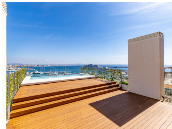
Large terrace with private pool