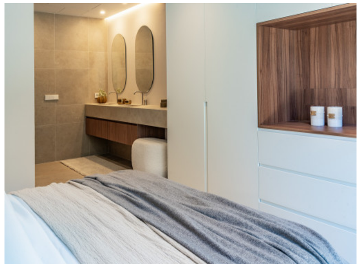
Master bedroom with en-suite bathroom

All information is correct to the best of our knowledge. Errors and prior sale excepted. This prospectus is purely for information purposes. Only the notarized deed of sale is legally binding.