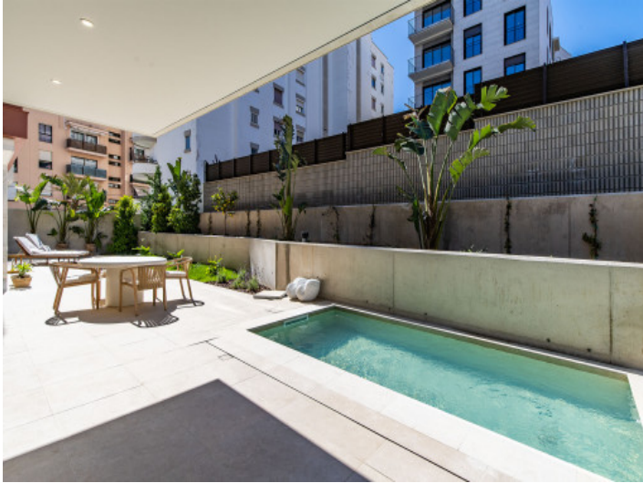
Large sun terrace with private pool