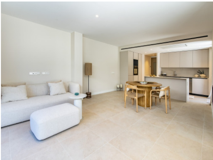
Open-plan living and dining area