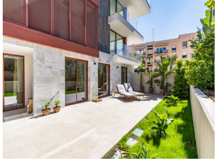
Large private terrace