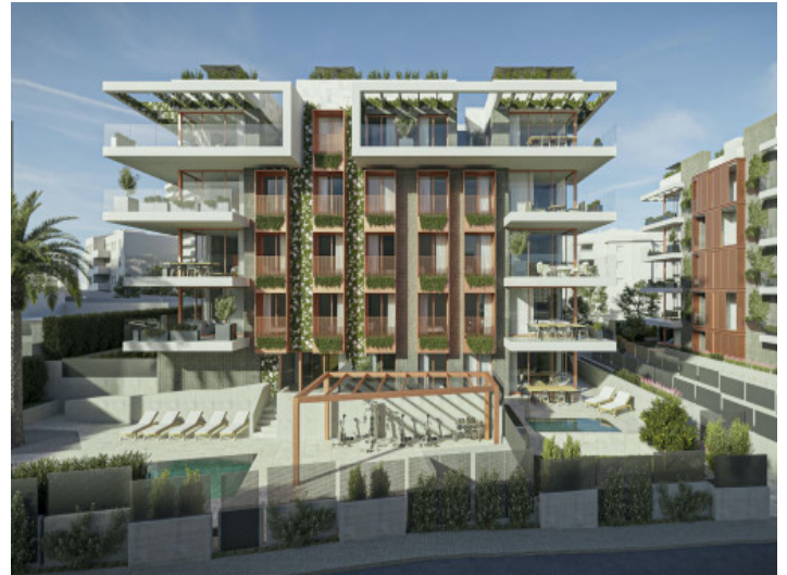
Exterior view and view of the pool area of the building project