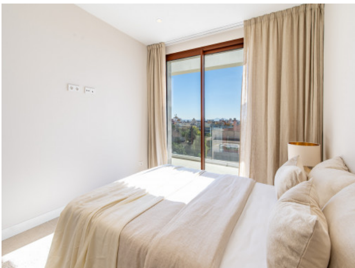
Eines von 3 Schlafzimmern