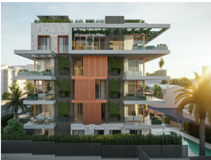
Exterior view of the building project