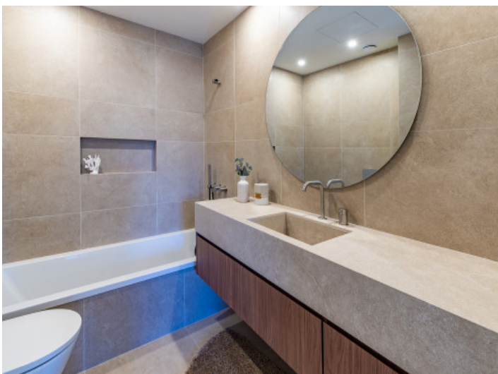
Eines von 2 Bädern