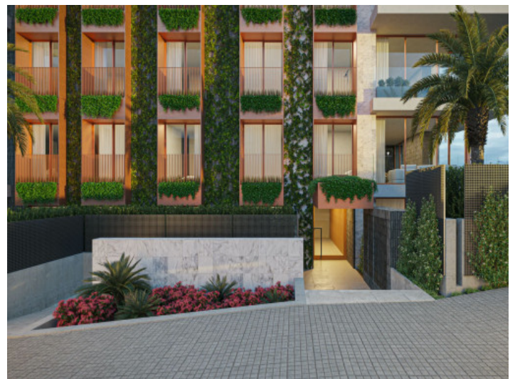
Exterior view of the building project