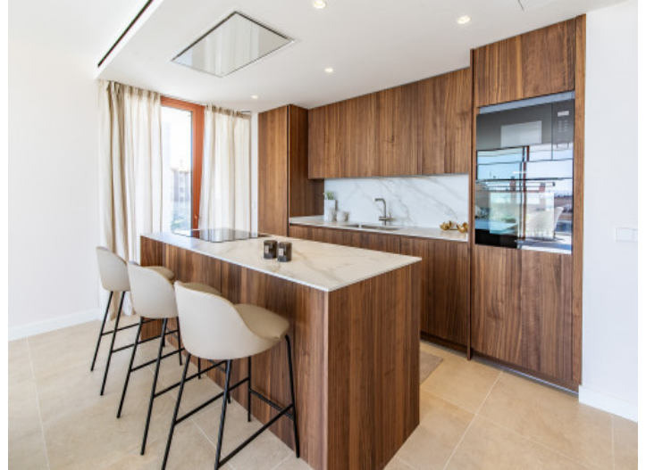
Luxuriöse offene Küche