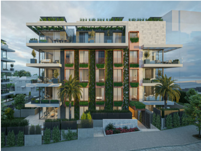
Newly-built penthouse with private roof top terrace in Palma