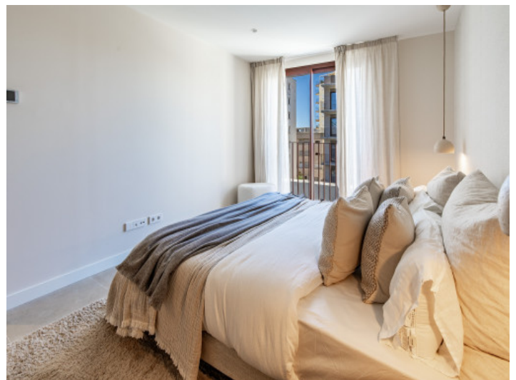
Eines von 3 Schlafzimmern