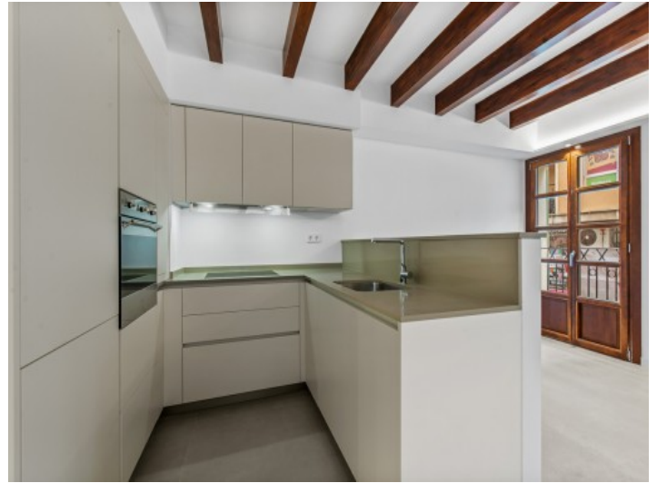
Modern, open kitchen