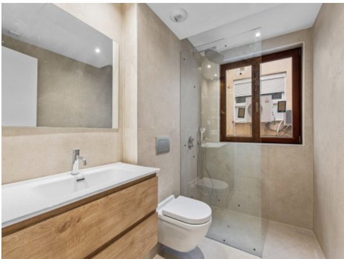
Modern shower bathroom