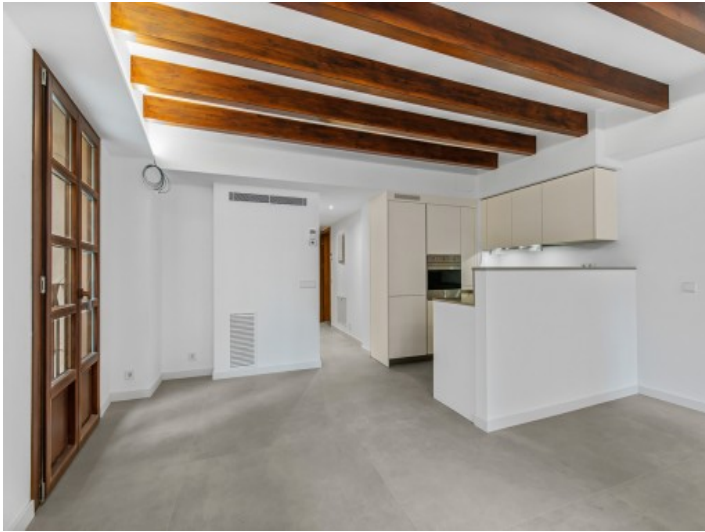
Open living and dining area with kitchen