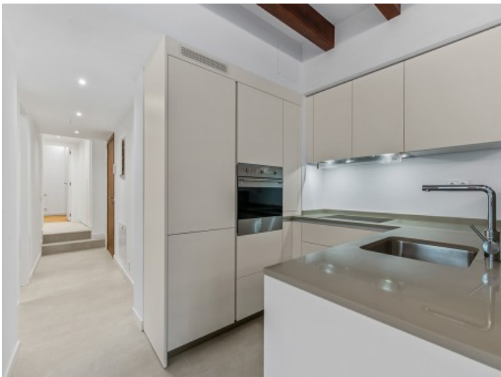
Kitchen and corridor