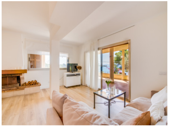
Living area with sea views