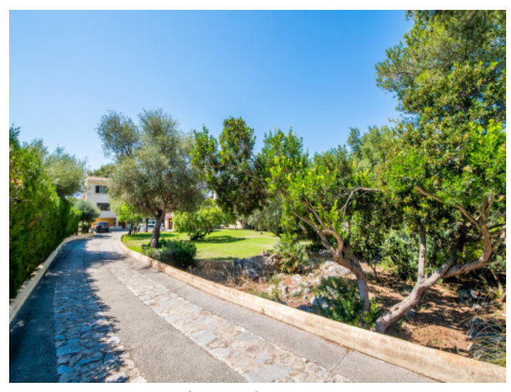
Access to the property