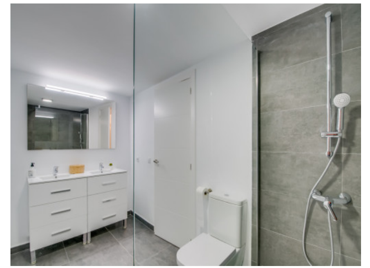
Elegant bathroom with shower