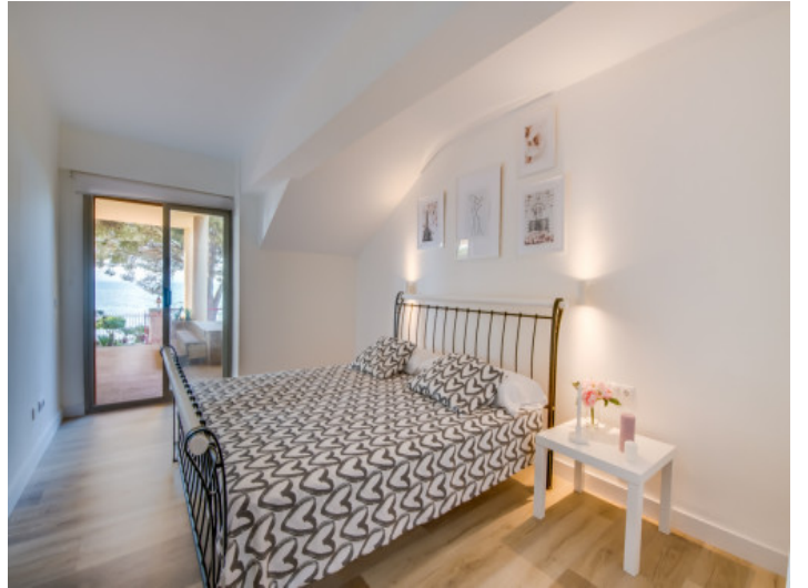
Large double bedroom

All information is correct to the best of our knowledge. Errors and prior sale excepted. This prospectus is purely for information purposes. Only the notarized deed of sale is legally binding.