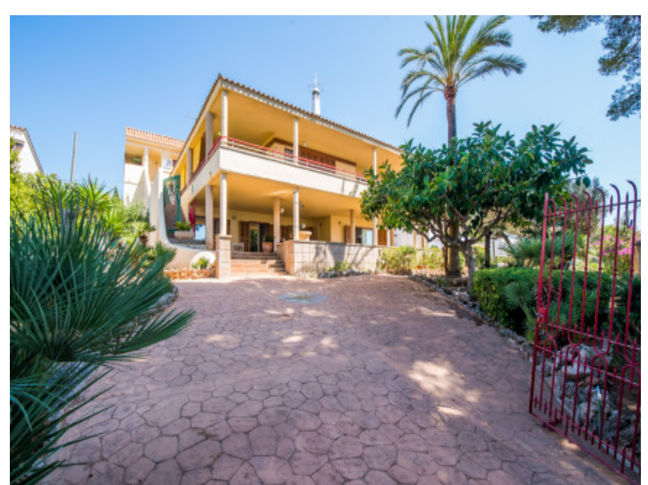
Access to the housse