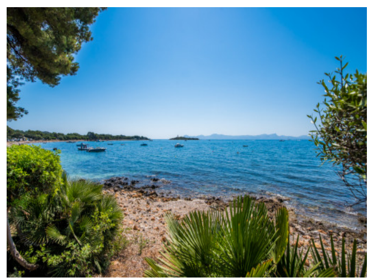
View of the sea