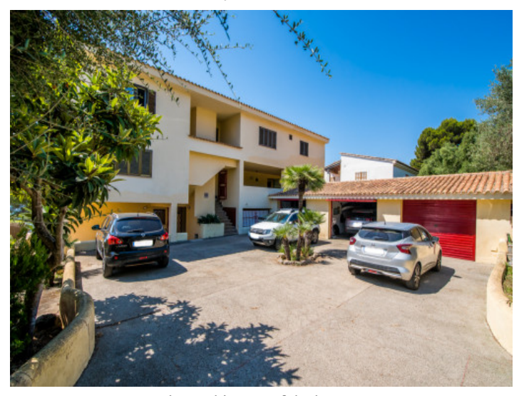
Large driveway of the house

All information is correct to the best of our knowledge. Errors and prior sale excepted. This prospectus is purely for information purposes. Only the notarized deed of sale is legally binding.