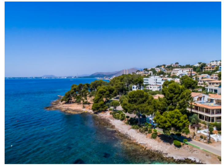
View of the sea