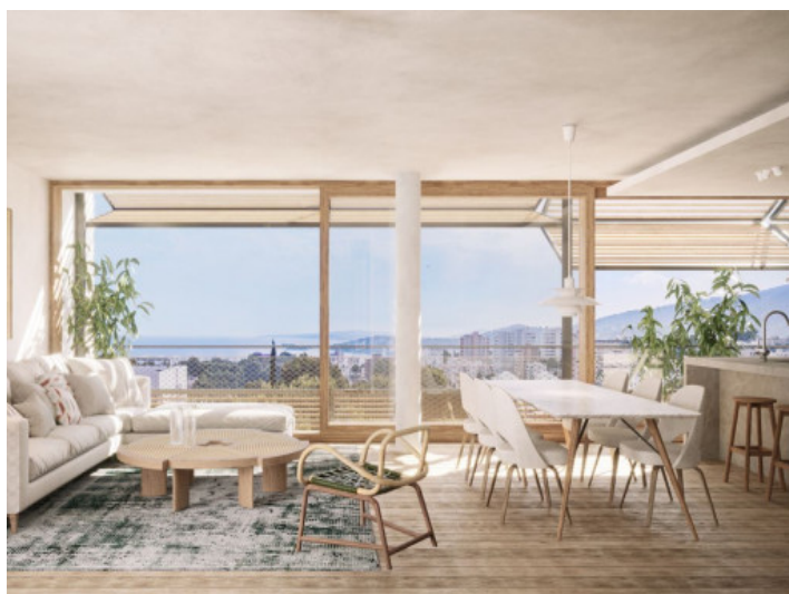
Light flooded living area with balcony and sea views