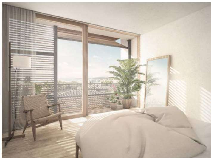
Spacious double bedroom