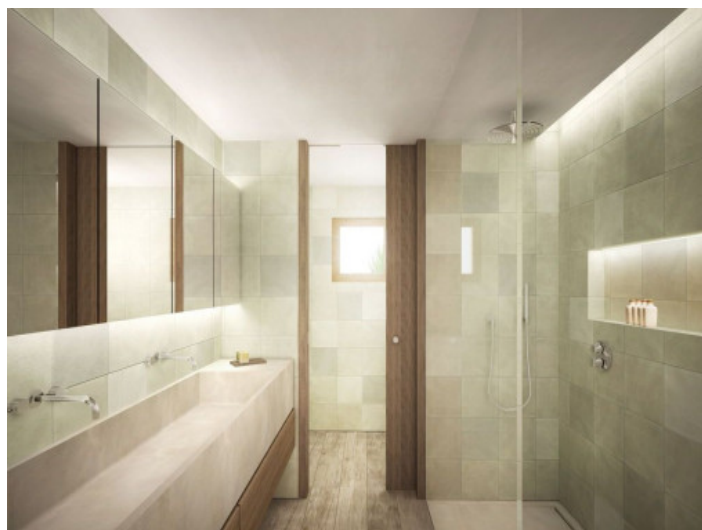
Noble bathroom en suite with walk-in shower

All information is correct to the best of our knowledge. Errors and prior sale excepted. This prospectus is purely for information purposes. Only the notarized deed of sale is legally binding.