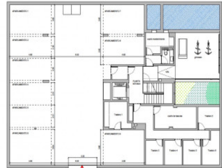
Construction plan garage