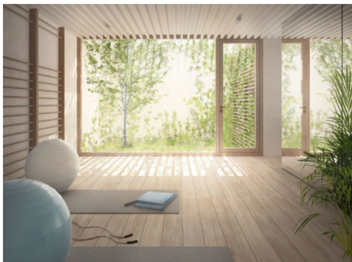
Airconditioned fitness area