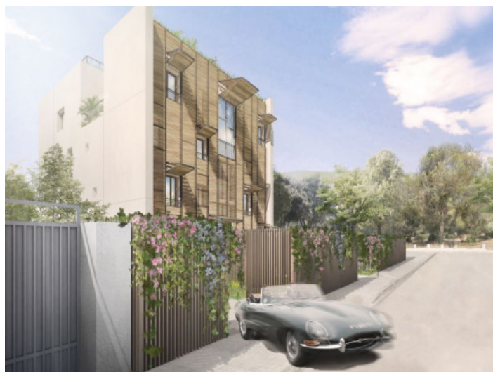
Exterior view from the street

All information is correct to the best of our knowledge. Errors and prior sale excepted. This prospectus is purely for information purposes. Only the notarized deed of sale is legally binding.