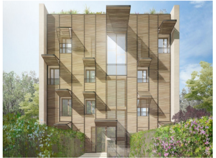
Exterior view of the complex