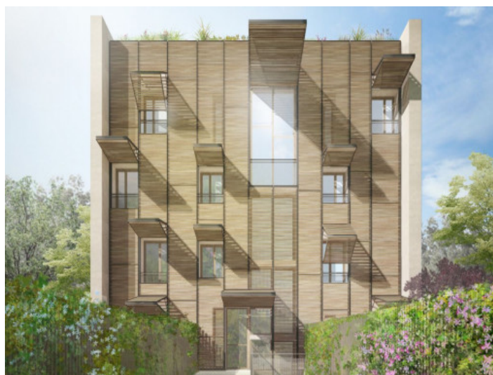
Exterior view of the complex