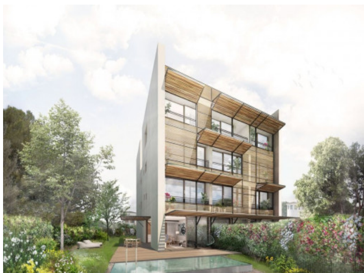
Exterior view of the complex