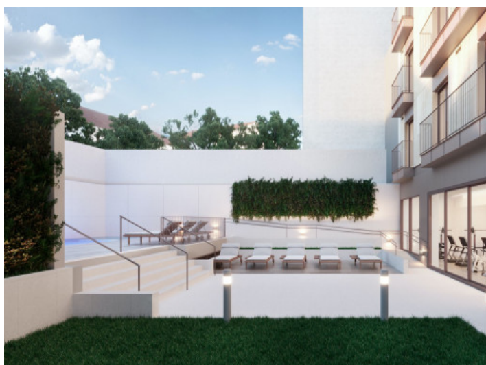
Terrace, pool and gym area