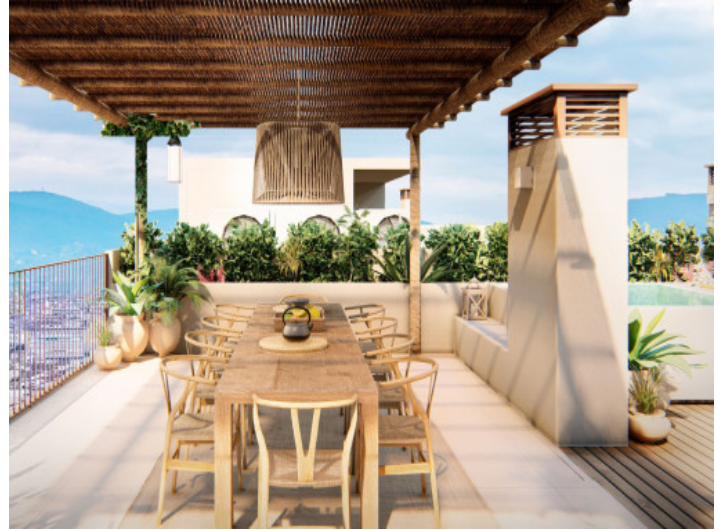
Splendid roof top terrace with dining area