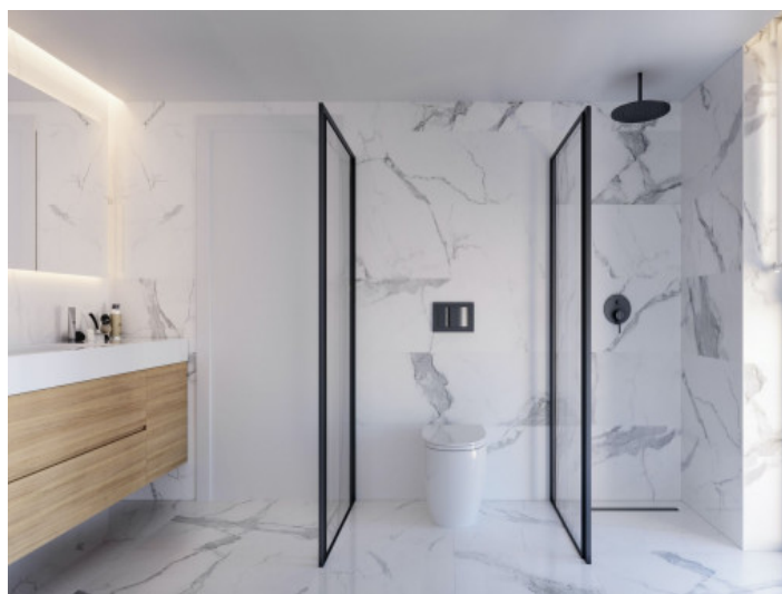
Bathroom - Shine