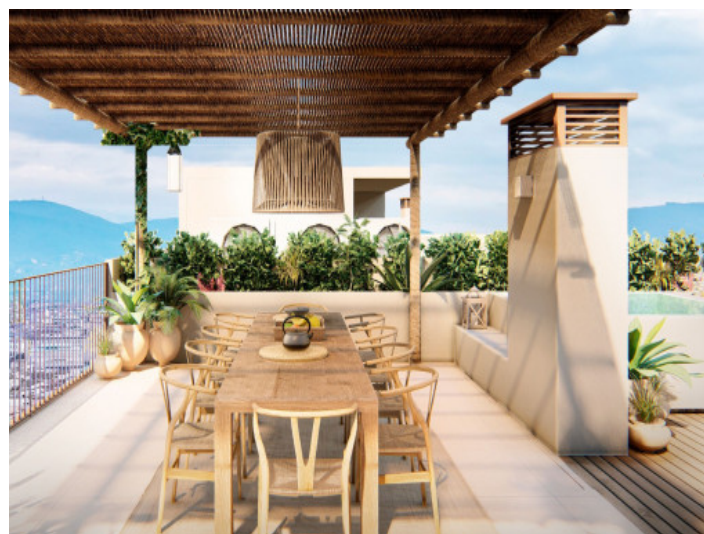
Splendid roof top terrace with dining area