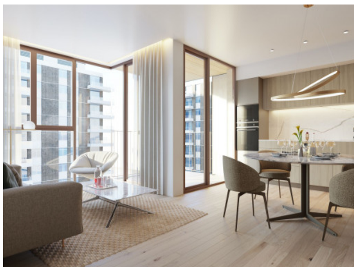
Kitchen and dining area