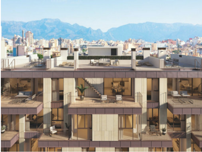
Exterior view of the complex