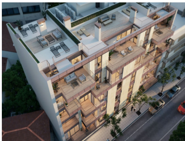
Exterior view of the complex