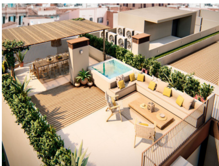
View of the roof top terrace

All information is correct to the best of our knowledge. Errors and prior sale excepted. This prospectus is purely for information purposes. Only the notarized deed of sale is legally binding.