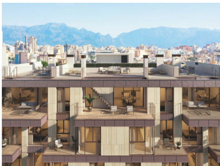
Exterior view of the complex