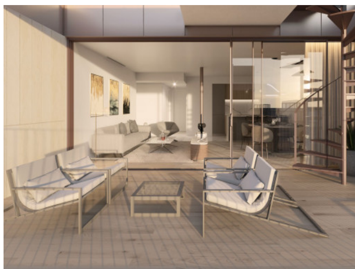
Terrace with sitting area

All information is correct to the best of our knowledge. Errors and prior sale excepted. This prospectus is purely for information purposes. Only the notarized deed of sale is legally binding.