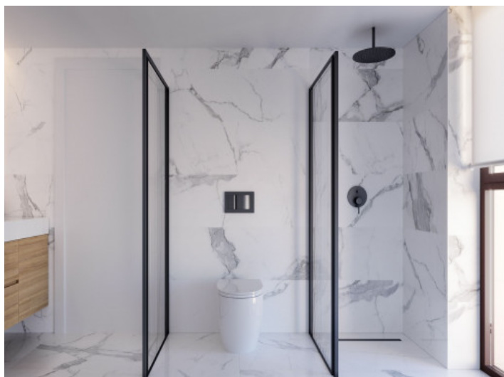
Bathroom - Shine