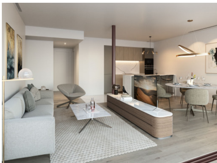
Living and dining area - Shine