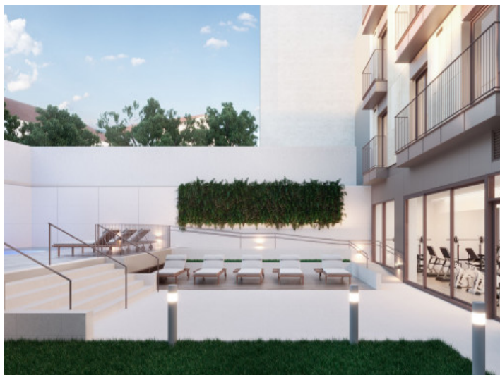
Terrace, pool and gym area