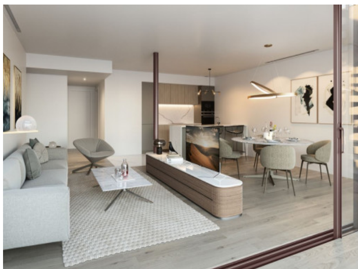
View of the living area