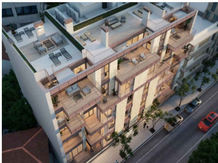
Exterior view of the residential complex